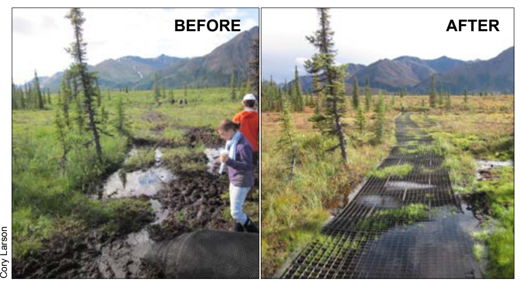
The difference after a year's work on the lack River Trail easement. There is trail braiding, ruts, mud, and trail damage before installing porous grid system trail stabilizers.

A project improved Gulkana River access on 17(b) easements along the Richardson Highway through a BLM partnership with the Wrangell Institute for Science and Environment and AmeriCorps. A young adult crew worked to brush the trails and install easement signs. In the process, the crew had an opportunity to see Alaska and benefit the nation's public lands.