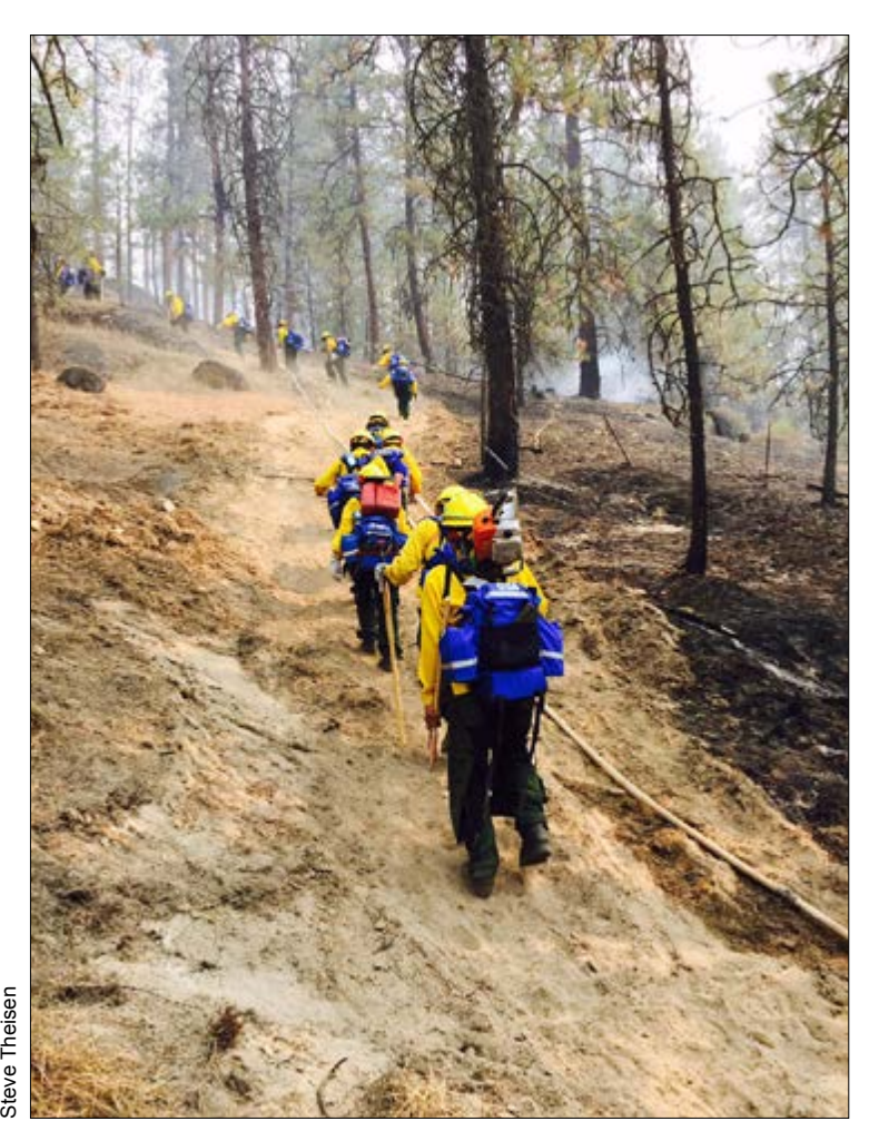
(above and right) The Allakaket Type 2 Crew working on the Clearwater Complex near Kamiah, Idaho. The Clearwater complex consisted of three fires in the Nez Perce-Clearwater National Forests totaling an estimated 39,200 acres.

The 2015 fire season was one of Alaska's busiest, with crews from throughout the Lower 48 and Canada providing assistance to fight hundreds of wildland fires. As Alaska's fire season wound down and fires in the Pacific Northwest and California ramped up, hundreds of Alaska firefighting personnel headed south to reciprocate.