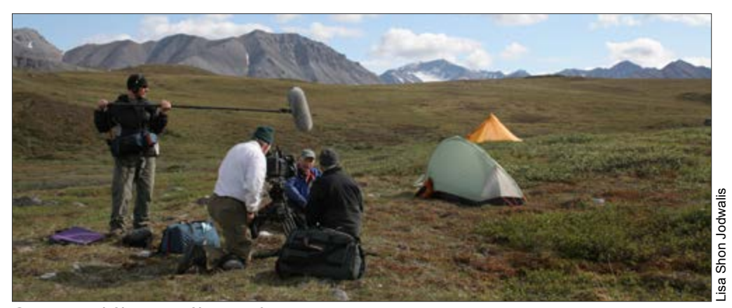
Commercial film crew filming a feature movie.

In recent years, Alaska has hosted innumerable film crews, many of them tied to the current craze of reality TV shows based in the state (A partial list includes "Life Below Zero," "Yukon Men," "Bering Sea Gold," "Deadliest Catch," Slednecks," "Flying Wild Alaska," and the "Ultimate Survival Alaska"). Did you know that the BLM issues commercial filming permits for shows like these, as well as for more traditional documentary film productions and commercial photography and video projects? The BLM uses the permit and its rules to protect resources as authorized under Section 302(b) of the Federal Land Policy and Management Act and in Title 43 Code of Federal Regulations (CFR) part 2920, Leases, Permits, and Easements.