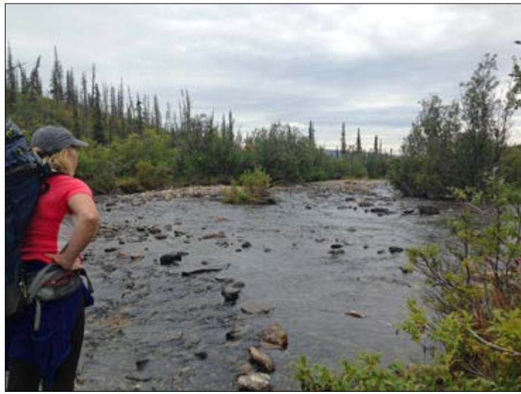
Hiker at site for stone trail crossing across Nome Creek

To celebrate the 15th anniversary of National Conservation Lands and 2015 National Public Lands Day, on August 29 volunteers worked to improve trail access from the boundary of the White Mountains National Recreation Area to the Mount Prindle Research Natural Area and the Steese National Conservation Area by constructing a stone trail crossing across Nome Creek. The Nome Creek trail leads from a BLM-managed campground through a non-motorized area to the alpine Mount Prindle Research Natural Area. The BLM Eastern Interior Field Office joined the Northern Alaska Environmental Center and the Conservation Lands Foundation to host this service day.