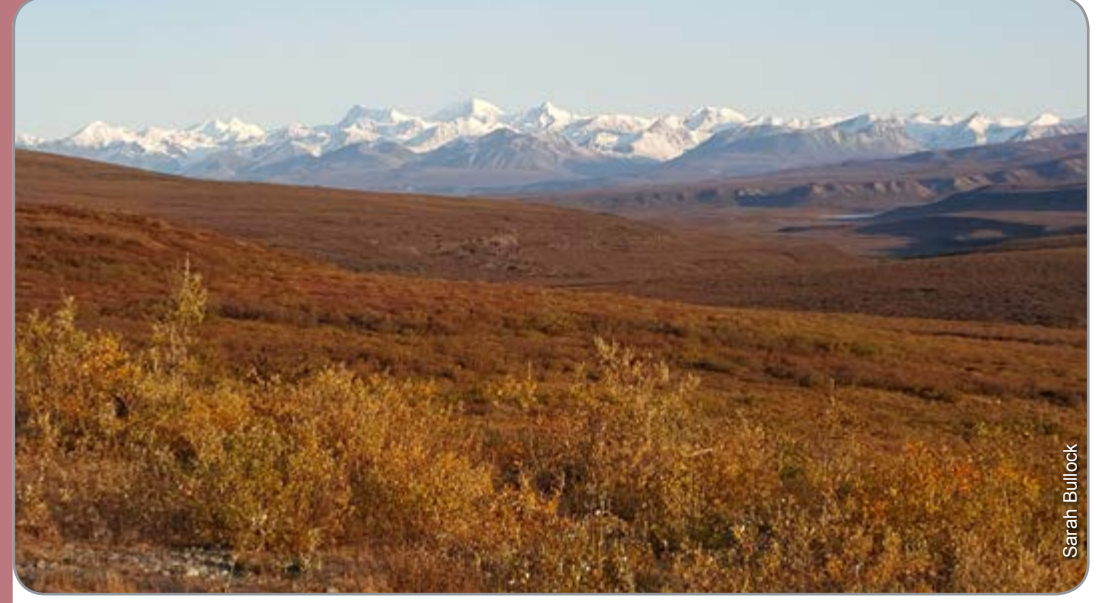
Fall foliage and snow-capped mountains near Tangle Lakes along the Denali Highway.