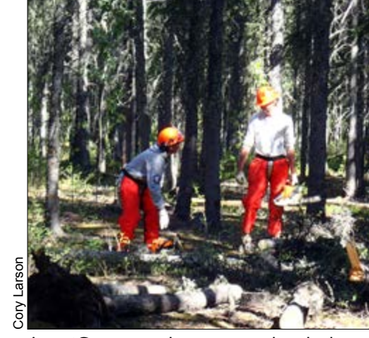
AmeriCorps members remove brush along ANCSA 17(b) easements.

Last summer, a partnership made it possible to construct a new trailhead/parking area for the Yanert River/Pyramid Mountain Trail easement along the Parks Highway near Carlo Creek. The Alaska Department of Fish & Game initiated the project and partnered with the BLM Glennallen Field Office, Ahtna Inc., a local horse user group, and the Alaska Department of Transportation. State funds and resources paid for constructing a new trailhead/parking area. The