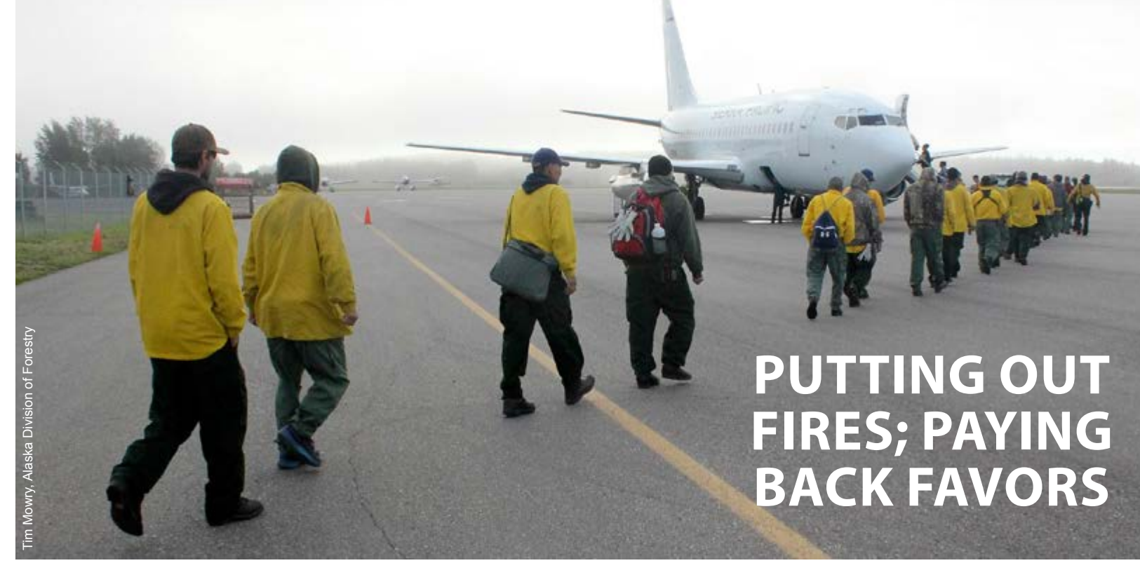
Type 2 Emergency Firefighting crews board a jet bound for the Lower 48 at the Alaska Fire Service.

Remember that when reality TV shows appear to be on public lands, in reality the producers may have spliced images together with video clips filmed on private lands. Don't believe everything you see!