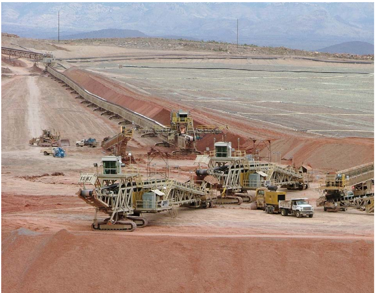
Stack loading at heap leach operation, Morenci