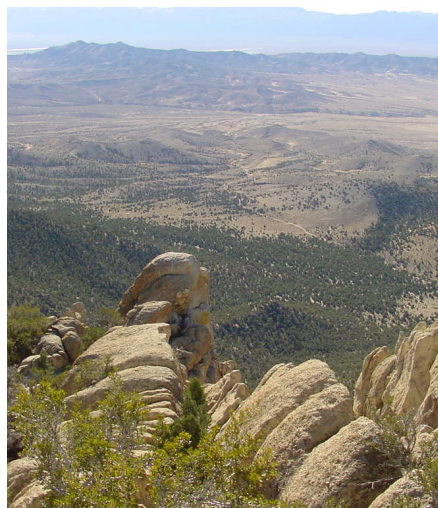
Kern Mountains (BLM)

The Eastern Nevada Landscape Restoration Project category will focus on activities that create and/or enhance strong and healthy native shrub ecosystems within the eligible portions of the Great Basin. Projects will be implemented that change the vegetation composition and/or structure to modify potential fire behavior for the purpose of improving fire suppression effectiveness and limiting fire spread and intensity, and at the same time increase the native shrub habitat over time.