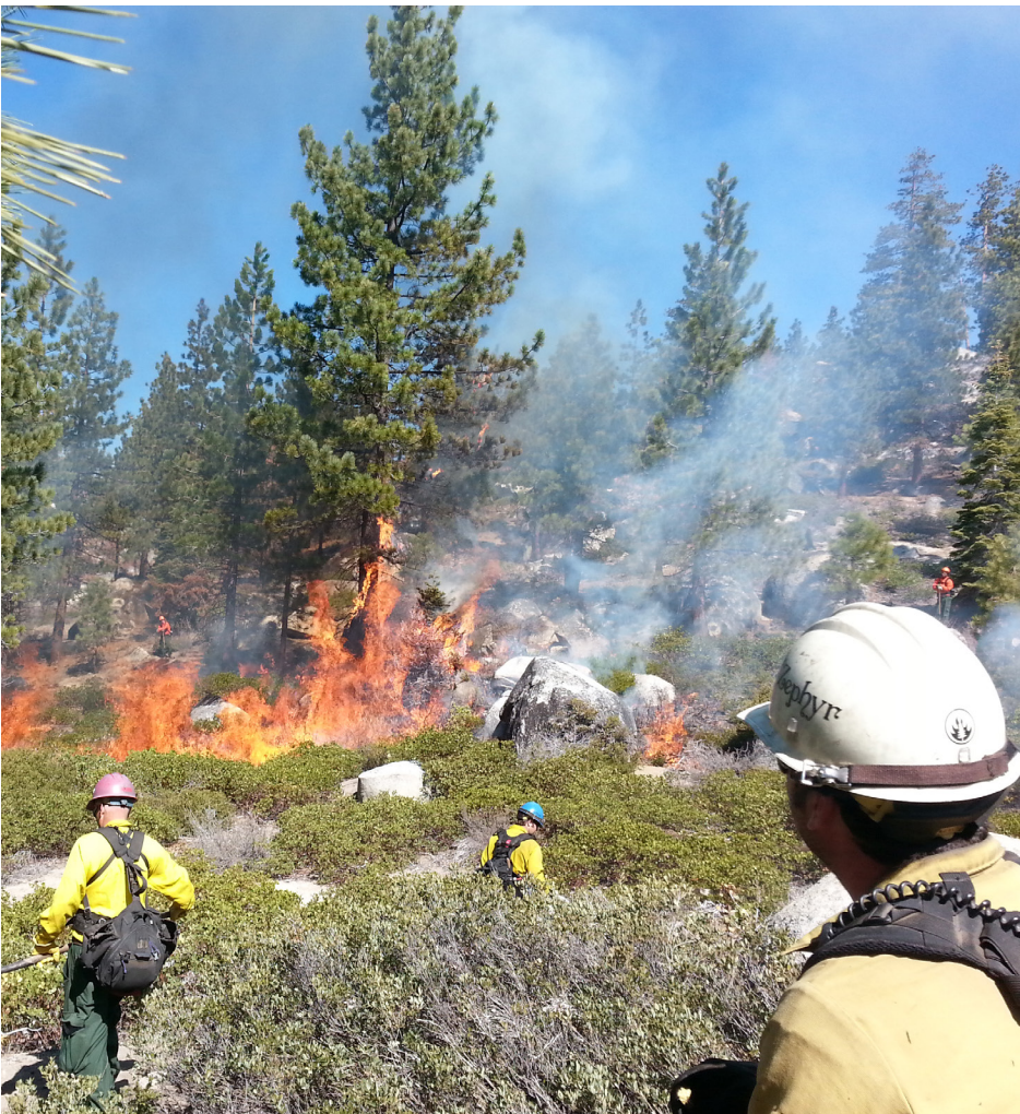
Tunnel Creek Prescribed Fire (State of Nevada)

The MSHCP category will emphasize habitat enhancement and outreach projects. Projects in this category will implement the goals and objectives of the MSHCP. In particular, projects will maximize prospects for long-term protection for habitats located in Clark County as well as the many native species of plants and animals identified in the MSHCP. In addition, Clark County may purchase lands or rights in land for purposes consistent with the implementation of the MSHCP.