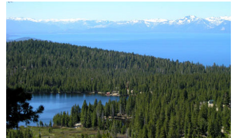
Incline Lake (USFS)

The SNPLMA authorizes the acquisition of environmentally sensitive land and interests in land within Nevada with priority given to acquiring lands in Clark County. Environmentally sensitive lands are those which promote the preservation of natural, scientific, aesthetic, historical, cultural, watershed, wildlife, and other resource values; enhance recreational opportunities and public access; provide for better management of public land through consolidation of Federal ownership, or otherwise serve the public interest.