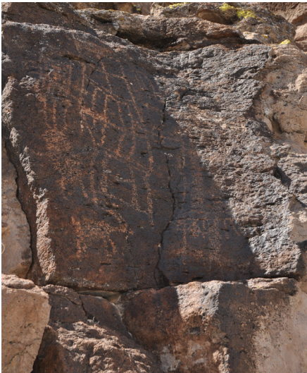
Black Canyon Petroglyphs (BLM)

Conservation Initiatives promote conservation and improve the quality of Federal land and resource values in Clark, Lincoln, and White Pine Counties, and Carson City, Nevada. Conservation Initiatives include planning, implementation, and monitoring. They also include programs critical to protecting and sustaining resources in Nevada, such as litter and desert dumping clean up and prevention, natural and cultural resource protection, recreation, environmental education and interpretation, and habitat restoration.