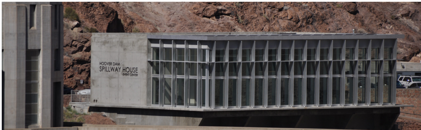
Hoover Dam Spillway House (BLM)

The category strategic guidance has been developed with input from the SNPLMA Program partners and stakeholders, the Category Subgroups, Partners Working Group, and Executive Committee. The Department of the Interior and United States Forest Service priorities will guide the project nomination and selection process. In addition, this guidance tiers from the Goals, Objectives, and Milestones in this Strategic Plan.