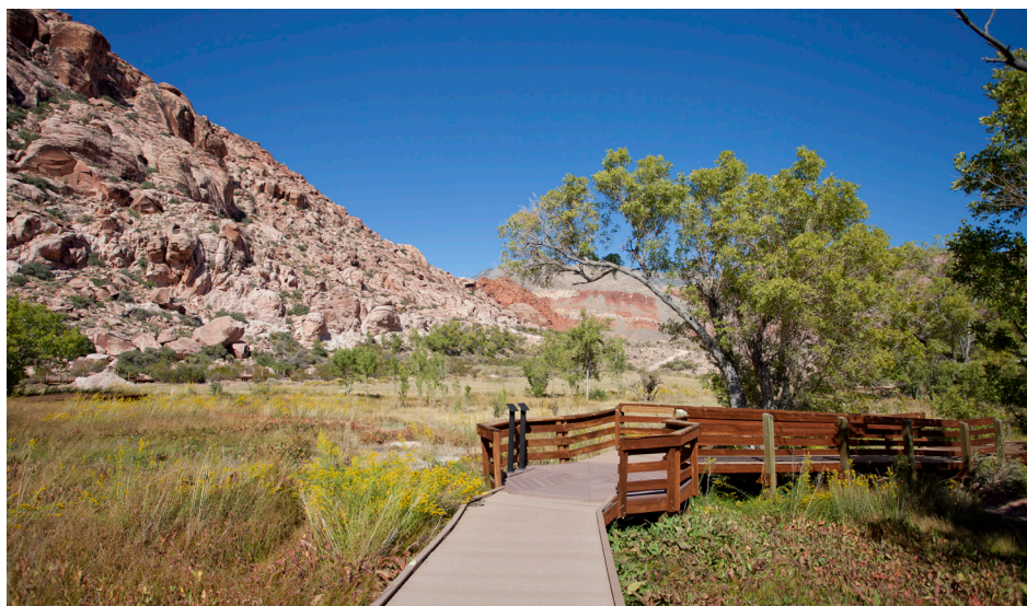
Red Springs Boardwalk (BLM)

ensure open and improved access to federal lands. All projects should be designed and scaled to ensure sustainable future operations and maintenance (e.g., low operations and maintenance expenses).