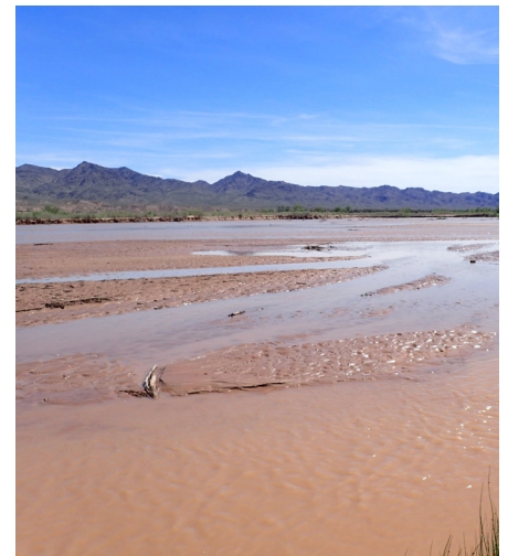
Virgin River (BLM)