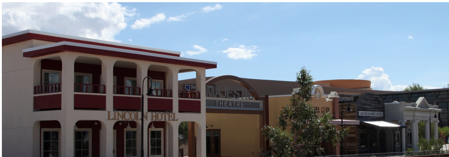
Boomtown 1905 at Las Vegas Springs Preserve (BLM)