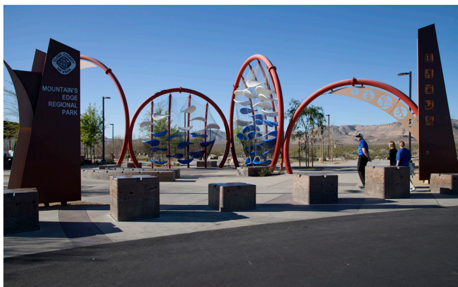
Mountains Edge Park in Las Vegas (BLM)