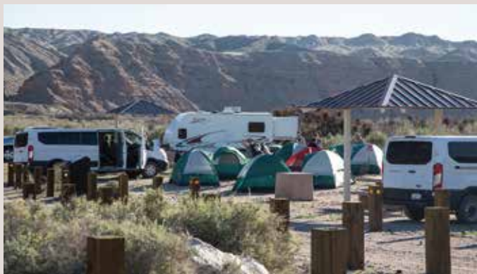
Afton Canyon Campground

Today, visitors can enjoy this 138-mile 4-wheel drive trail from nearby Camp Cady to the shore of the Colorado River.