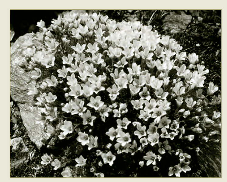
Arctic Sandwort growing on the rock scree.

Crowberry. (Empetrum nigrum) Crowberry Family. A mat-forming, evergreen shrub with small, narrow leaves and maroon flowers, producing an edible berry.