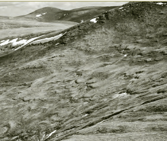
Solifluction lobes found in the Pinnell Mountain area.

Other permafrost-related features include polygonpatterned ground fissures and "seas of rocks," created over thousands of years as frost pushes fractured rocks to the surface.