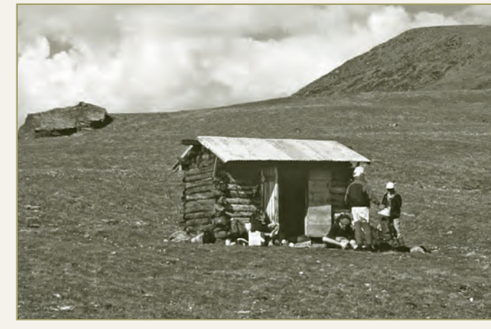
Ptarmigan Creek Shelter Cabin.

All of Alaska is bear country. Remember to watch for bears and other wildlife. Cooking should take place outside the shelter cabins so that animals are not attracted to them. Cook food away from sleeping areas and downwind from tents. Always keep a clean camp. Human waste should be buried at least 200 feet (60 m) from water sources, and all garbage, including toilet paper, should be hauled out. Please do not leave food in the cabins for the next people to pack out. Remember - "If you pack it in, pack it out."