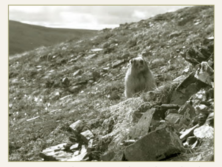
Hoary Marmot living among the tundra and rock scree.

and willow ptarmigan (Lagopus lagopus). Both are close relatives of grouse, but unlike their cousins, ptarmigan turn from brown to white with the seasons, making them difficult for predators to see.