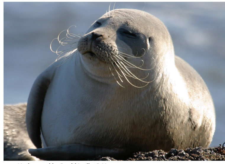
Harbor seal

The Unit is home to nine special status species, including plants, mammals, birds, amphibians, fish and insects. Commonly seen marine animals include harbor seals seen loafing on the rocks and migrating gray whales.