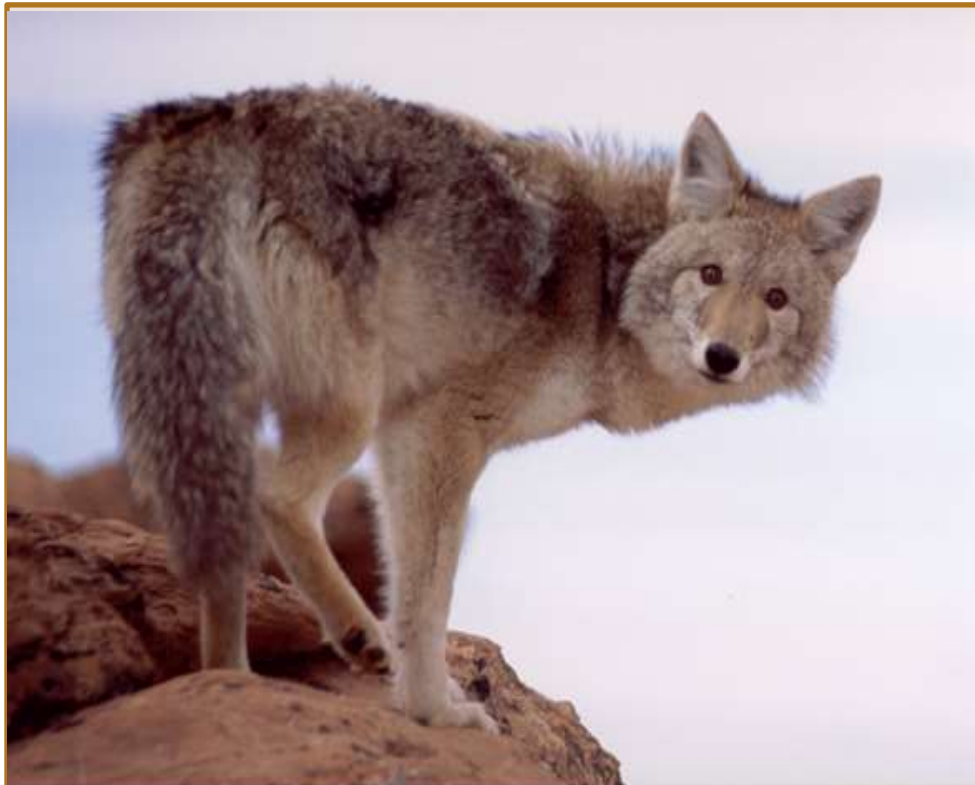
Coyote by Barron Haley

Weight: 15 pounds – 46 pounds Height: 22 inches to 26 inches Max speed: 40 mph (65 km/h) Body length: 29 inches to 34 in