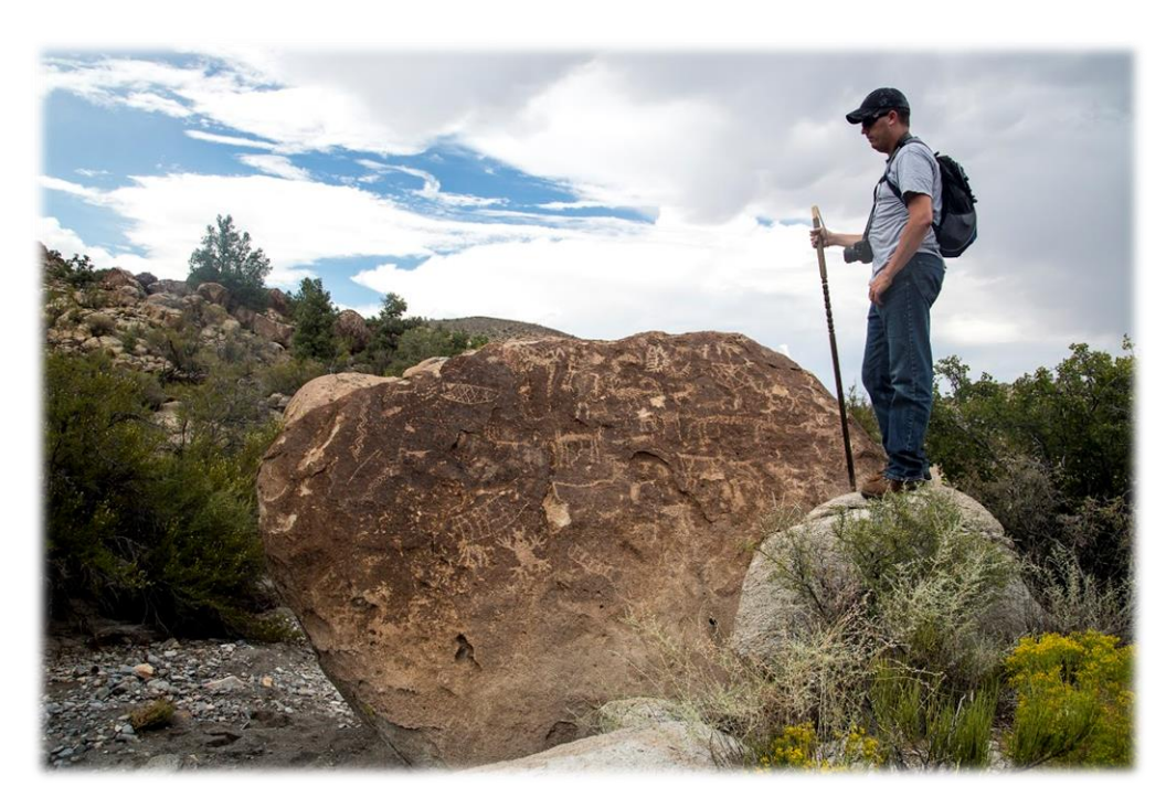
Petroglyphs at Shooting Gallery rock art site

Of the 709 resources documented, there is a single property listed on the National Register of Historic Places (NRHP), which is the White River Narrows Archaeological District. There are 272 properties eligible for the NRHP. There are 405 properties that are not eligible for the NRHP. The remaining 31 properties have not been evaluated for their eligibility to the NRHP. Completion of the Class I Inventory and draft Historic Context for the BARNM is anticipated in FY17.