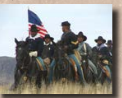
The New Buffalo Soldiers portrav Con pany D, 9th Cavalry in a re-enactment.

Buffalo Soldiers of the 9th Cavalry. Slow down, get comfortable and think of those who came before. Remember to honor private property rights and federal and state laws as you cross these lands, and please do not move or remove any natural or manmade object from its place in this very special landscape.