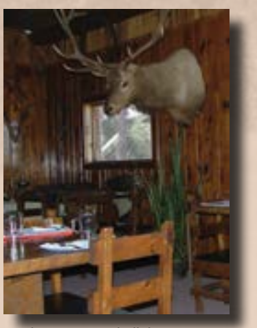
Eagle Guest Ranch dining roon at the Datil Crossroads was built around 1900, and has been serving hamburgers, steaks and pies ever since

Bureau of Land Management Socorro Field Office 901 South Highway 85 Socorro, New Mexico 87801 575/835-0412 www.blm.gov/new-mexico