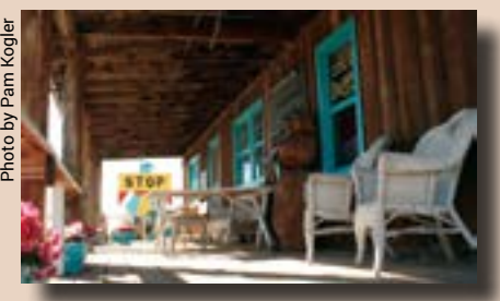
The Pie-O-Neer is one of several places in F Town for a great meal or snack.

Featured in the movie Contact, The Very Large Array (VLA) is part of the National Radio Astronomy Observatory. One of the world's premier astronomical radio observatories, it consists of 27 dish radio antennas in a Y-shaped configuration on the Plains of San Agustín. Each antenna is 82 feet in diameter. The data from the antennas are combined electronically to give the resolution of an antenna 22 miles across. There is a visitor center just south of Highway 60.