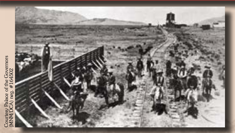
Magdalena Stockyards circa 1885

The Magdalena Trail ranks in importance with the famous Chisum and Goodnight-Loving Trails. What sets it apart is its continued use into the 1970s.