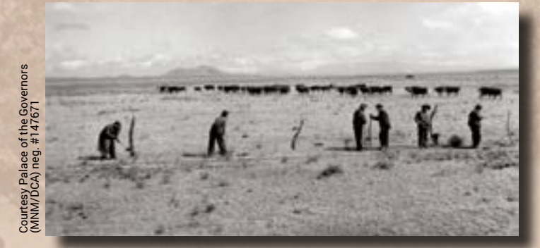
CCC construction of Stock Driveway fence

THE CCC: In July of 1935 Civilian Conservation Corps (CCC) Camp DG-42-N was established between Magdalena and Datil in anticipation of work projects to improve the Driveway. The camp was under the jurisdiction of the Division of Grazing, as indicated by the "DG" in the camp name.