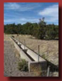
Example of a trough installed by the CCCthis one is at BLM's Datil Well Campground.