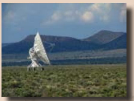
In addition to the VLA visitor center, a sel guided walking tour features informative signs and a trail leading to the base of one of the giant dish antennas.