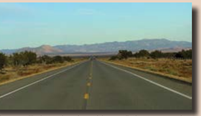
Highway 60 will take you through Magdalena, Datil, Pie Town, Quemado, and on to Springerville, Arizona.

DRIVING TOUR: You can tour the trail via Highway 60 from Socorro to Springerville or the other way around as the livestock did.