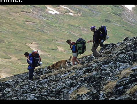
There are two shelter cabins located on the Pinnell Mountain National Recreation

northeast of Fairbanks, the 27-mile (44 km) Pinnell Mountain National Recreation Trail entirely above timberline. The trail is marked with rock cairns as it crosses open tundra with views north to the Yukon River and south to the Alaska Range. Wooden posts along the trail show the mileage 107 on the Steese Highway) to the trail's end at Twelvemile Summit (milepost 85.5, Steese Highway). Two emergency shelters provide refuge from storms, but hikers should come prepared for unpredictable, dramatic alpine weather. Thunderstorms and mountain fog are common during the