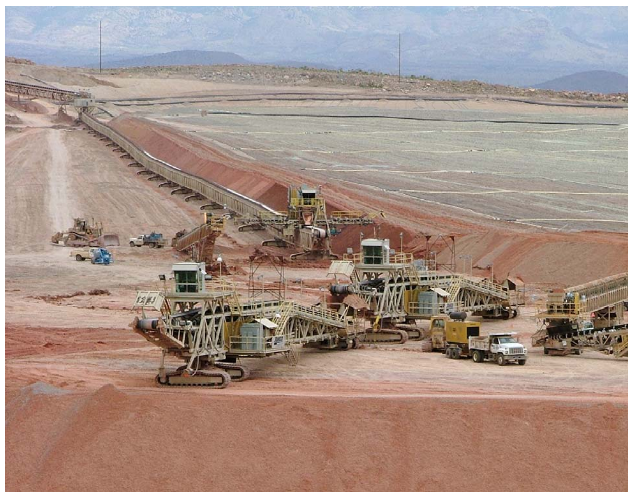
Stack loading at heap leap operation, Morenci