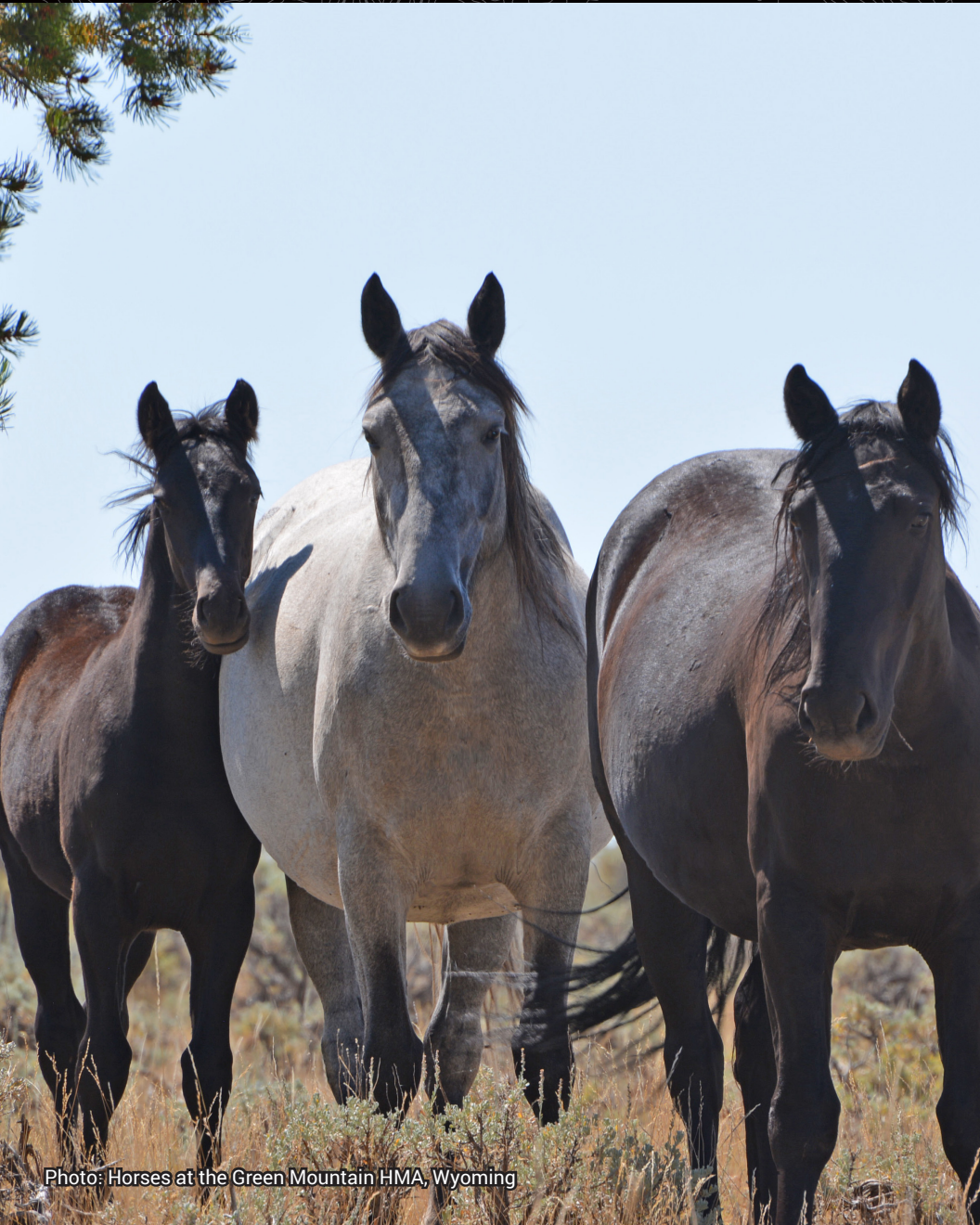
Photo: Horses at the Green Mountain HMA, Wyoming