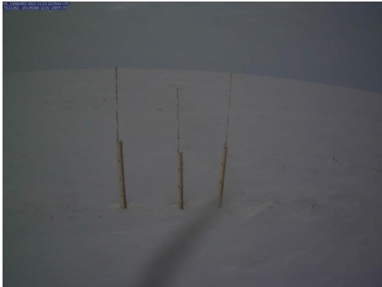
Photo taken 11/23/21 at Station H (Ocean Point) showing variability in snow depth cover: