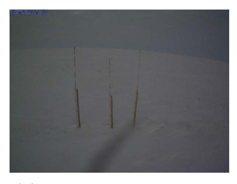
Photo taken 11/23/21 at Station H (Ocean Point) showing variability in snow depth cover: