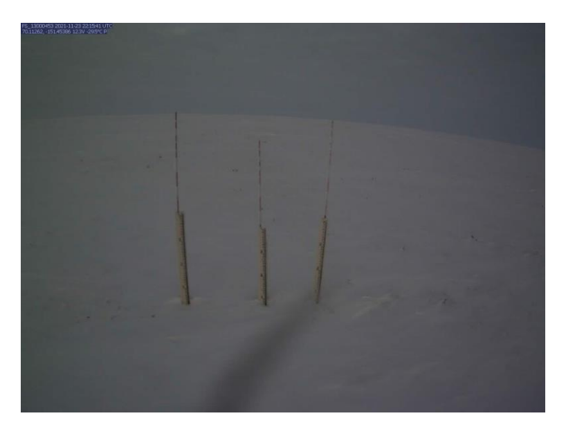
Photo taken 11/23/21 at Station H (Ocean Point) showing variability in snow depth cover: