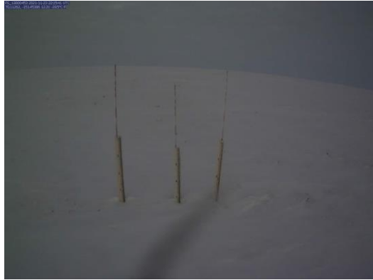
Photo taken 11/23/21 at Station H (Ocean Point) showing variability in snow depth cover: