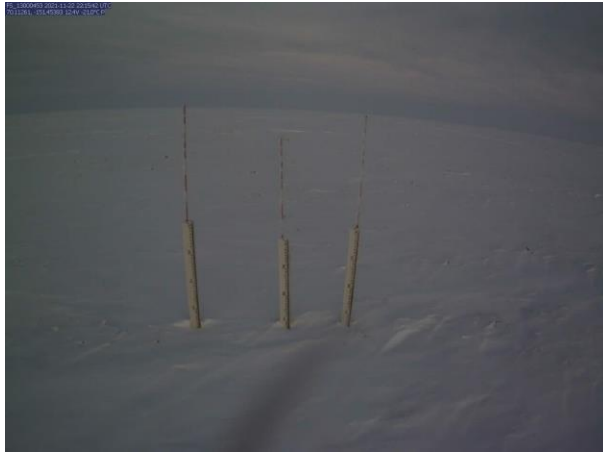
Photo taken 11/22/21 at Station H (Ocean Point) showing variability in snow depth cover: