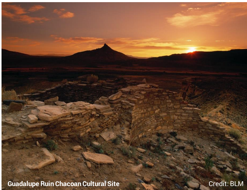
Guadalupe Ruin Chacoan Cultural Site

In addition to its incredible beauty, the Chaco Canyon area is one of the world's most unique and culturally significant landscapes. Located in the high desert of northwest New Mexico, this valley served as the center of the Chacoan culture for a roughly 400-year span, from 850 - 1250. The sophistication of this culture is clearly visible in the grand scale of the architecture set in a landscape of sacred mountains, mesas, and shrines that have deep spiritual meaning to this day.