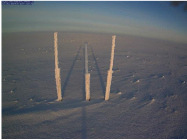
Photo taken 10/30/21 at Station H (Ocean Point) showing variability in snow depth cover: