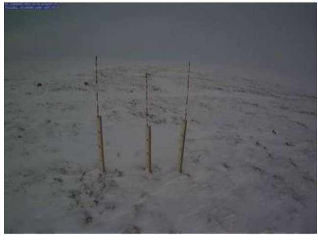
Photo taken 10/19/21 at Station H (Ocean Point) showing variability in snow depth cover: