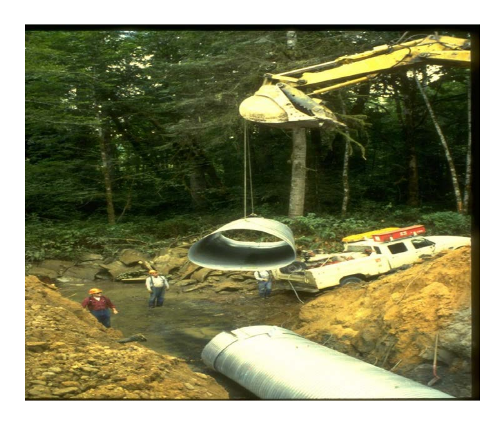
Culvert construction in western Oregon.