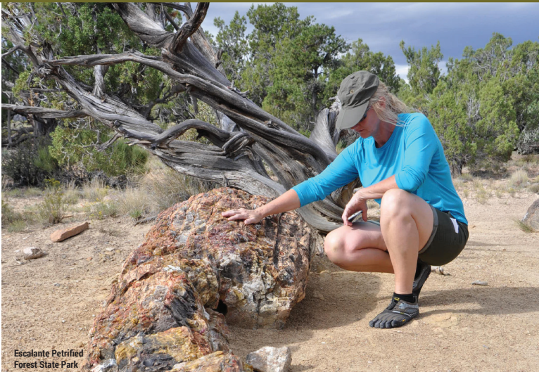
Escalante Petrified Forest State Park