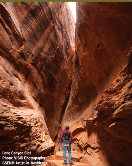
Long Canyon Slot