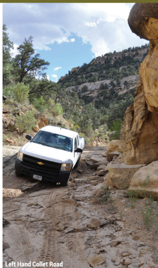
Left Hand Collet Road