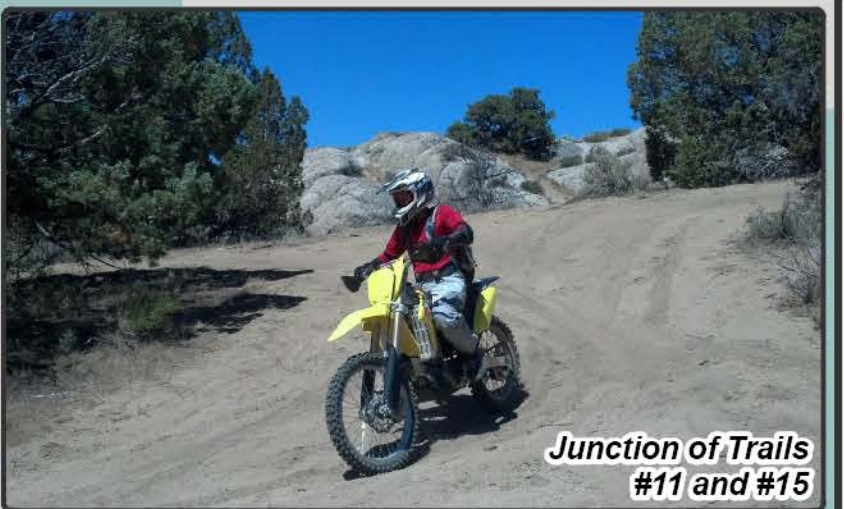
Junction of Trails #11 and #15