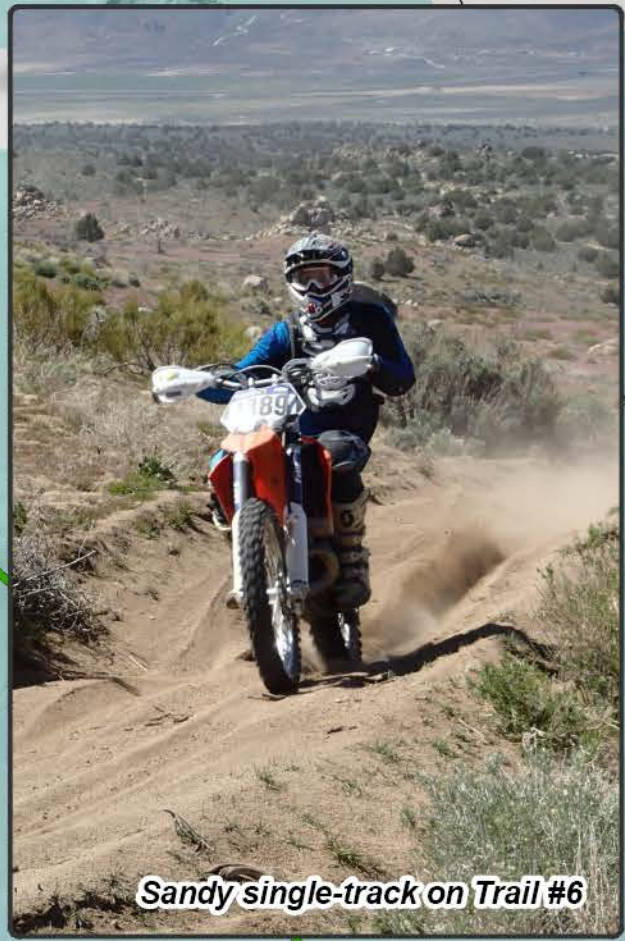
Sandy single-track on Trail #6