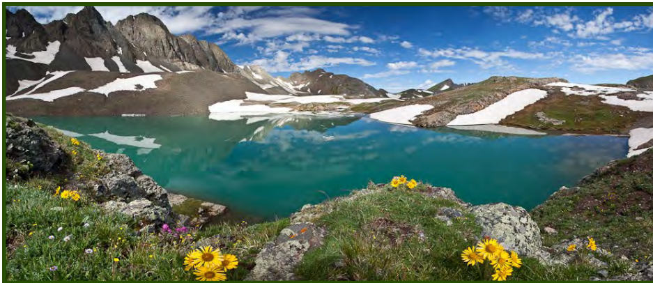
Handies Peak WSA, Colorado