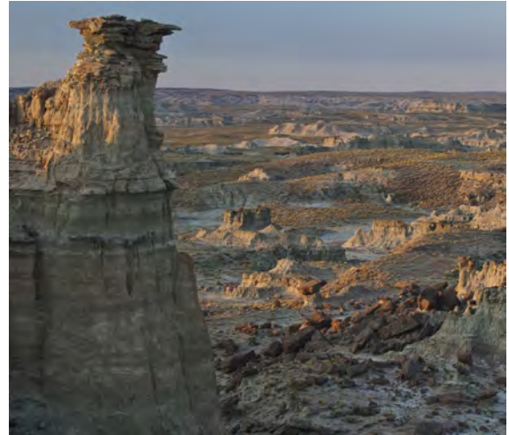
Adobe Town WSA, Wyoming

WSAs are areas that the BLM inventoried in a 1980 congressionally-directed study and found to have legally defined wilderness characteristics. These lands are generally roadless areas of at least 5,000 acres, largely undeveloped and natural, and provide outstanding opportunities for solitude or primitive and unconfined recreation. Until Congress decides whether to release a WSA or designate it as Wilderness, WSAs are managed to protect their wilderness characteristics and suitability for Wilderness designation.