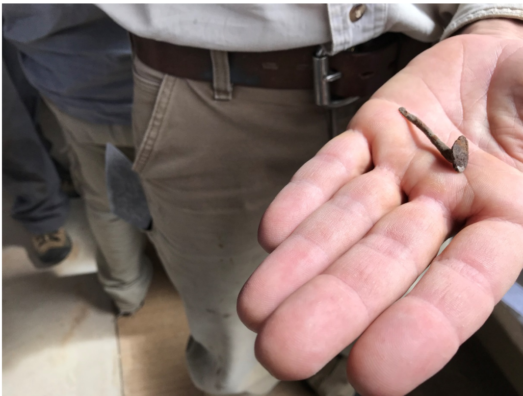
Figure 4. A hand-forged nail was one of the metal detector finds.

Class members were complimentary about the class and for the opportunity to learn so much in a short period of time. For those members who had never used a metal detector before the class was a unique experience, but one that they hoped to repeat in the near future.