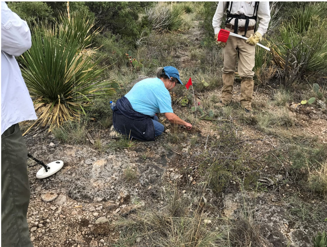
Figure 3. Holly Houghten, Mescalero Apache Tribe Preservation Officer, prepares to investigate a metal detector find spot.

The fieldwork sessions allowed the participants to get comfortable using a metal detector and before long red flags were sprinkled throughout the survey area as finds were made. This was an eye-opening experience for many of the prehistoric archeologists as artifacts invisible on the ground surface began to be discovered. Significant discoveries included cone-shaped metal tinklers (called jingles by modern Mescalero Apache tribal members) that were (and are used today) as decoration on clothing and artifacts such as woven baskets. Also found were a portion of a decorative piece used on a horse bridal, historic lead balls and bullets (some fired), a hand-forged nail, and metal buttons, some from pre-Civil War uniforms. All of these find locations were marked with GPS readings and they were cataloged in the field. The information collected by the class will be added to previous survey information from the site to form a more complete picture. The metal detector information will also be useful to the Park Service for future management of the site location.