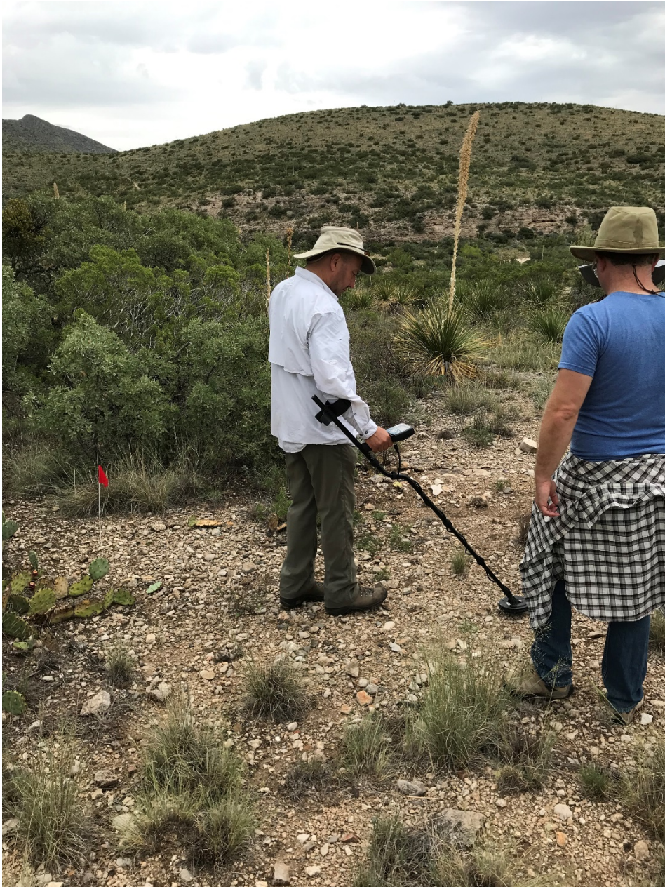
Figure 2. Students use metal detectors at an historic Mescalero Apache site. Find spots are marked with red flags.

a natural defensive stronghold within secluded drainages and canyons. Their security was challenged during November-December 1869, when a cavalry unit attacked and destroyed three rancherías. This military action ultimately forced many of the Mescalero to abandon the Guadalupe Mountains and surrender themselves to military authorities at Fort Stanton, NM. Archaeological evidence suggests the AMDA field session was conducted on one of rancherías that was attacked and destroyed by the U.S. cavalry in 1869.