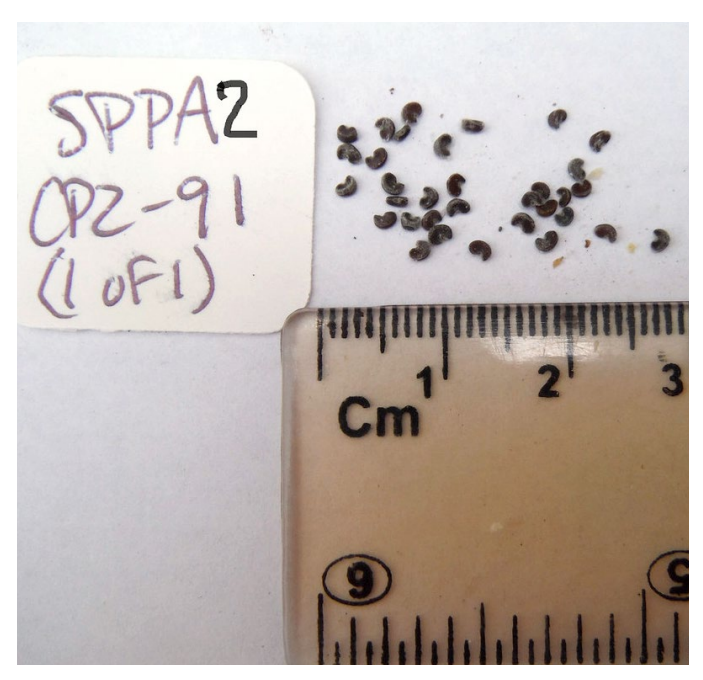
Figure 11. Clean small-leaf globemallow seed.

but AOSA guidelines for tetrazolium chloride (TZ) viability testing of the Sphaeralcea genus are available. Seed is prepared by soaking it overnight at 68 to 77 °F (20-25 °C) followed by staining with 0.1 or 1% TZ concentrations. Seed is nonviable if any part of the embryo or endosperm is unstained. Clipping prior to soaking and staining is recommended for hard seeds (AOSA 2010).