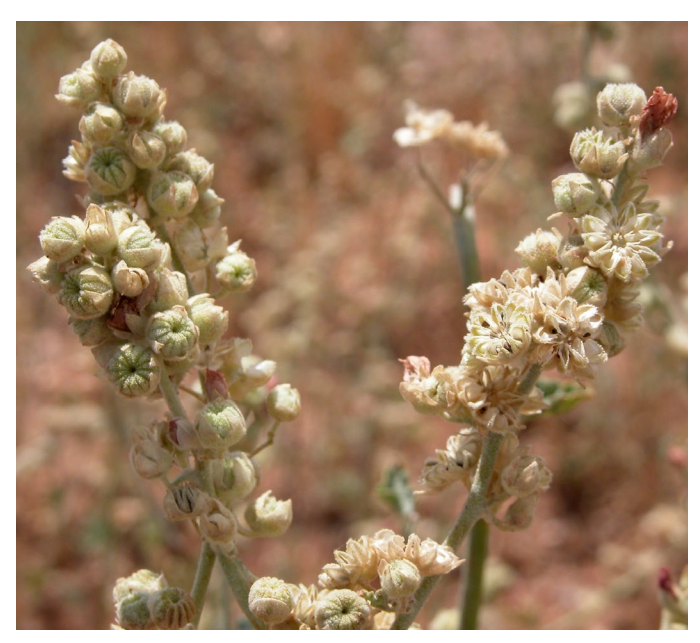
Figure 5. Small-leaf globemallow schizocarps on plants growing at the Vermillion Cliffs area, near the Utah-Arizona border.

Flowers are numerous, clustered, and crowded in panicles (Fig. 4) (Munz and Keck 1973; LBJWC 2018). There are distinct internodes between the flower clusters and commonly more than one flower per node. Flower buds have a distinct beak. (Kearney 1935; Welsh et al. 1987; La Duke 2016). The pedicel measures 2 to 10 mm long and is shorter than the densely pubescent calyx, which is 4 to 8 mm tall at anthesis (Kearney 1935; Munz and Keck 1973). Flowers have five orange to red petals each 7 to 18 mm long (Kearney 1935; Welsh et al. 1987; La Duke 2016). Flowers have many stamens. The filaments are united forming a column, which surrounds the pistils. The fruit is a segmented schizocarp (Fig. 5). The united stamen column and segmented schizocarps are characteristic of the Malvaceae (Weber 1976). Schizocarps are 4 to 5.5 mm in diameter and divided into 9 to 12 mericarps each with 2 or sometimes 1 seed. Mericarps are ellipsoid, 3 to 5 mm high, and half or more as wide (Munz and Keck 1973; Holmgren et al. 2005; La Duke 2016). Seeds are kidney shaped, dark brown to black with a fine network of veins, 1.7 to 2 mm long, and more or less pubescent (Kearney 1935; Holmgren et al. 2005).