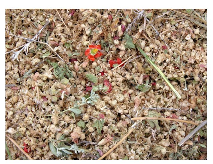
Figure 10. Mechanically harvested small-leaf globemallow seed from dense stands growing near the Utah-Arizona border.

Weather patterns in western Arizona may allow for spring and fall seed harvests (Comstock et al. 1988). When small-leaf globemallow was monitored at two Mojave Desert sites, plants flowered in both the spring and fall, which coincided with the bimodal rainy periods. Flowering peaked in April. Plants in this area experienced considerable dieback and were essentially dormant through the summer drought conditions. The winter during this one-year study period was also uncharacteristically warm and mild (Comstock et al. 1988).