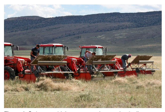
Figure 9. Strippers with hoppers used to mechanically harvest dense small-leaf globemallow stands growing near the Utah-Arizona border.