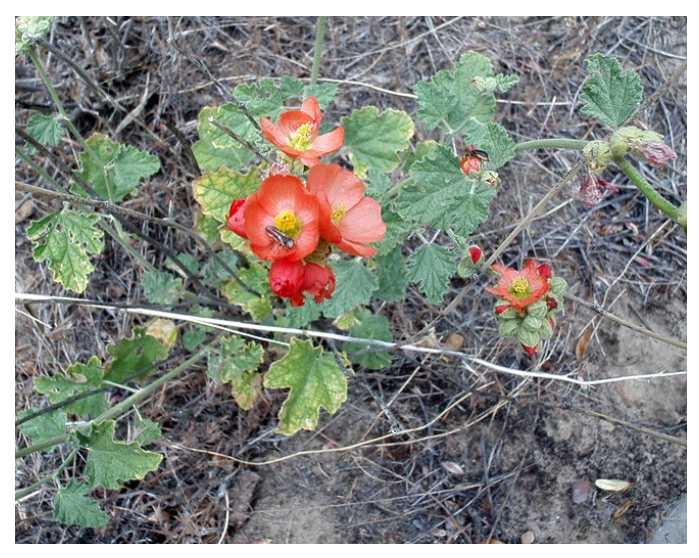
Figure 3. Small-leaf globemallow growing in Utah.