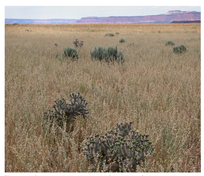
Figure 8. Dense wildland stand of small-leaf globemallow setting seed at the Vermillion Cliffs area near the Utah-Arizona border.

(1,398 m) elevation in Grand County, Utah (USDI BLM SOS 2017). The latest harvest date was August 11, 2010 from a site at 6,317 feet (1,925 m) elevation in Coconino County, Arizona. Of the 42 collections made over an elevation range from 4,196 to 7,262 feet (1,279-2,213 m), 37 were harvested in June or July. Thirty-five collections were from Utah and the others came from Nevada, Arizona, and Colorado (USDI BLM SOS 2017). In small-leaf globemallow stands established from transplants, flowering dates varied by site and plant age (Pendery and Rumbaugh 1990). First flowering was earlier at a northern Utah (early June) than at a southern Idaho site (late June). Average date of first flowering at both sites was 1.5 months earlier (June 1) for second year plants than it was for plants in their establishment year (July 15). Researchers also reported drier conditions in the second year (Pendery and Rumbaugh 1990).