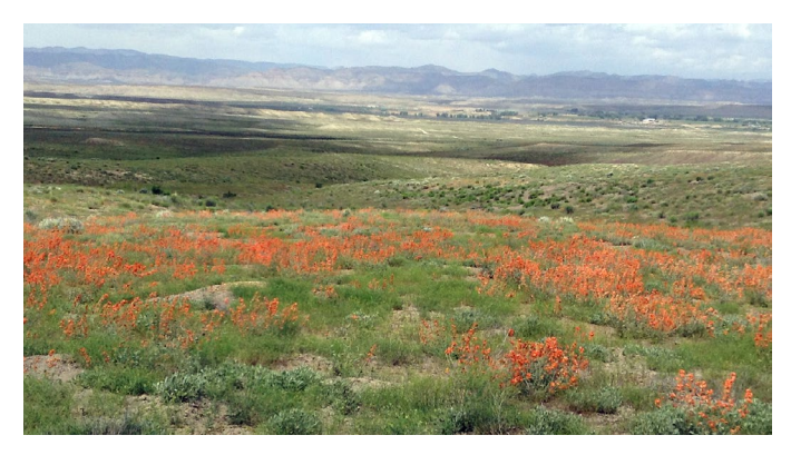
Figure 1. Small-leaf globemallow growing in Colorado.

Habitat and Plant Associations. Dry slopes, mesas, washes, and roadsides are common small-leaf globemallow habitats (Munz and Keck 1973, Holmgren et al. 2005, La Duke 2016; LBJWC 2018). Associated vegetation in these habitats includes greasewood (Sarcobatus spp.), saltbush (Artiplex spp.) blackbrush (Coleogyne ramosissima), sagebrush (Artemisia spp.), pinyon-juniper woodlands (Pinus-Juniperus spp.), and mixed mountain brush (Fig. 1) (Munz and Keck 1973; Welsh et al. 1987; Holmgren et al. 2005).