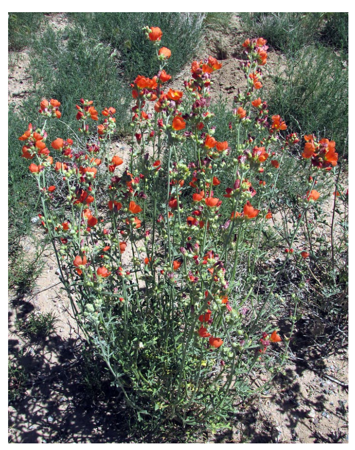
Figure 2. Small-leaf globemallow growing in Utah.

Small-leaf globemallow is a perennial with a large taproot and a branching, stout, woody caudex (Fig. 2) (Kearney 1935; Welsh et al. 1987). Plants produce several to many erect stems up to 3.3 feet (1 m) tall (Munz and Keck 1973; Holmgren et al. 2005; La Duke 2016). Stems are slender (≤ 5 mm in diameter at the base), unbranched or more commonly short-branched, and densely covered with stellate hairs, at least when young (Kearney 1935; Holmgren et al. 2005). Basal leaves are lacking; stems leaves are alternate (Munz and Keck 1973; Welsh et al. 1987; Holmgren et al. 2005). Larger leaves are 0.6 to 2.2 inches (1.5-5.5 cm) long and about as wide with 0.4 to 2-inch (1-5 cm) long petioles (Welsh et al. 1987). Leaf blades are thick and lack lobes or have 3 (sometimes 5) shallow, broad, rounded lobes (La Duke 2016; LBJWC 2018). Leaves are covered with a stellate pubescence (La Duke 2016), prominently 5-veined on the under sides, and have rounded and regularly toothed margins (Fig. 3) (Kearney 1935).