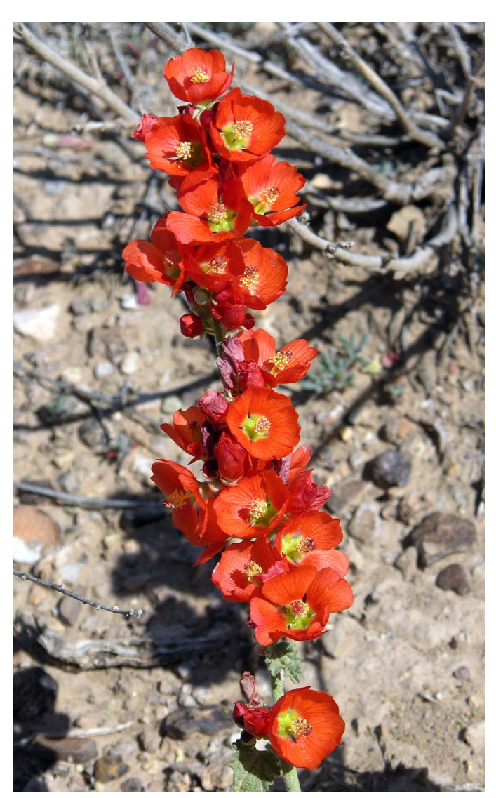
Figure 4. Small-leaf globemallow inflorescence on a plant growing in the Uintah Basin of Utah.