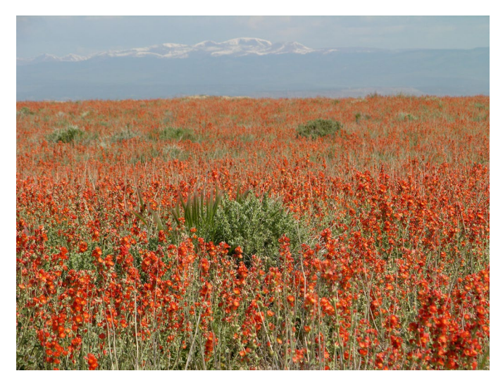
Figure 6. Extensive stand of small-leaf globemallow growing in the south-central portion of Utah's Uintah Basin.

Seed Sourcing. Because empirical seed zones are not currently available for small-leaf globemallow, generalized provisional seed zones developed by Bower et al. (2014), may be used to select and deploy seed sources. These provisional seed zones identify areas of climatic similarity with comparable winter minimum temperature and aridity (annual heat:moisture index). In Figure 7, Omernik Level III Ecoregions (Omernik 1987) overlay the provisional seeds zones to identify climatically similar but ecologically different areas. For site-specific disturbance regimes and restoration objectives, seed collection locations within a seed zone and ecoregion may be further limited by elevation, soil type, or other factors.