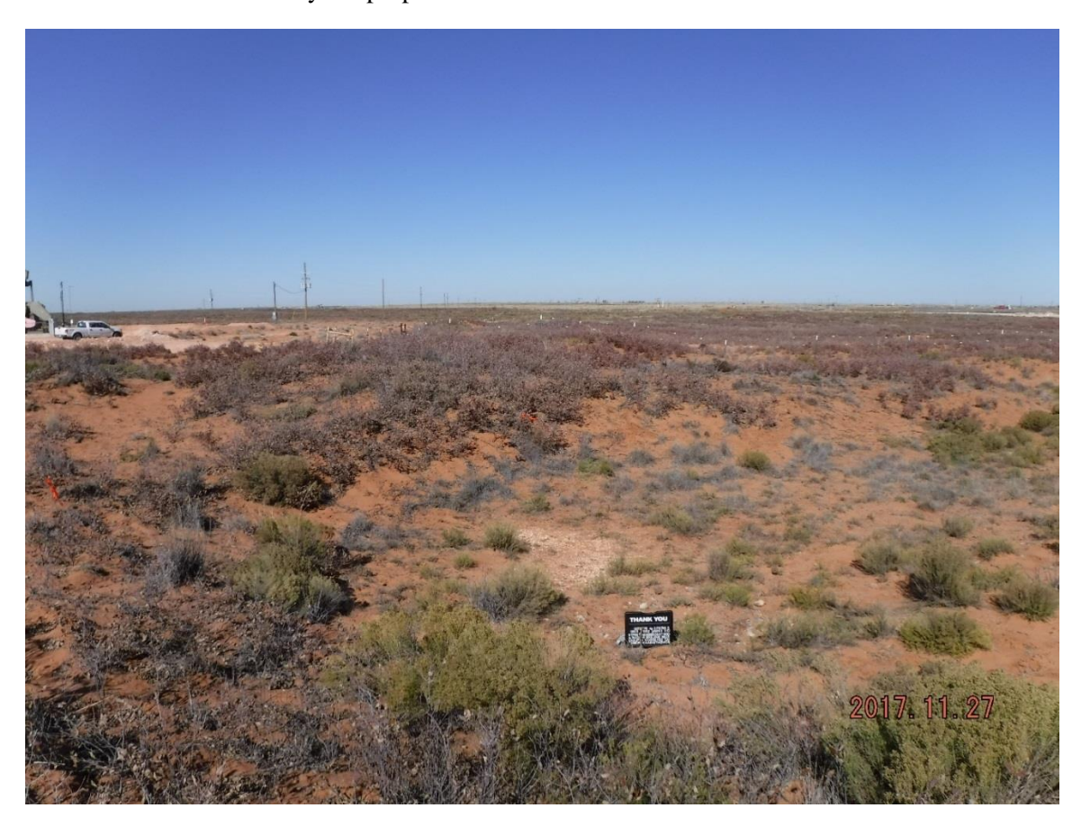
Figure 2. Overview of LA 176300 looking north. This site was monitored during construction of the well pad that is in the upper left corner of the photograph.

There are quirks in using the PA that mostly involve land ownership. The PA area includes BLM surface managed land, but there are checkerboard localities that include New Mexico SLO and private property. Since PA projects cannot be approved on SLO land, applicants for pipeline projects that cross from BLM to SLO land have to arrange for archaeological surveys of the state property. The same is true for well pads that are located on SLO property but that have BLM minerals. Since use of the PA is voluntary, there are still archaeological surveys being completed within the PA area for projects that are eligible but not submitted for PA review by the proponents.