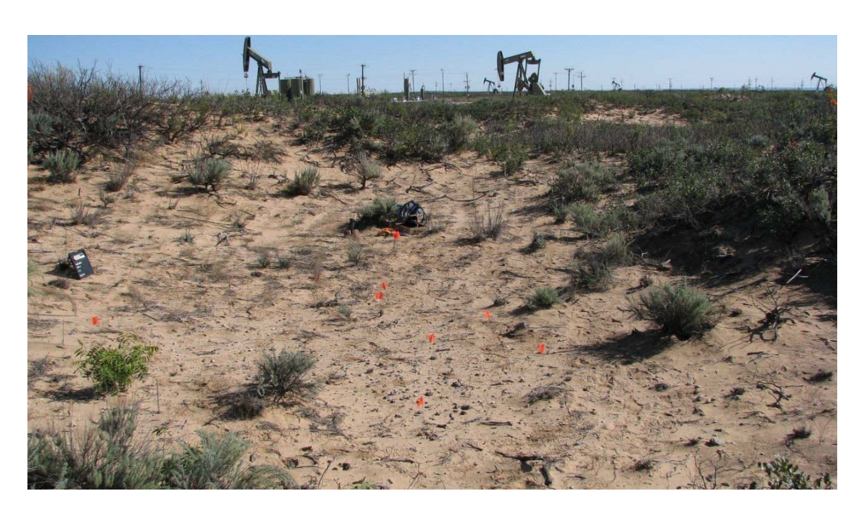
Figure 3. Overview of LA 190144 looking north. This was a previously unrecorded site discovered during the survey.

Less than 0.05 ac of eligible site area was impacted (Graves et al 2018:136-137).