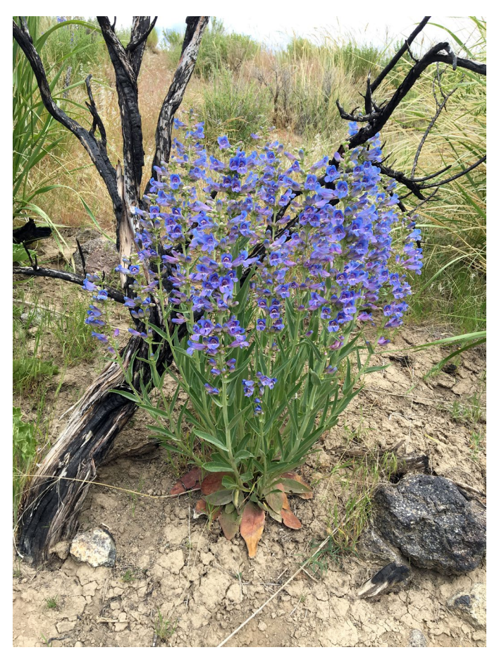
Figure 6. Royal penstemon one year after wildfire.

experienced under a snow pack followed by 4 weeks of incubation at 50 to 68 °F (10-20 °C) in light increased germination to 70%. Germination increased to 90% with 24 weeks of prechilling (Meyer and Kitchen 1994).