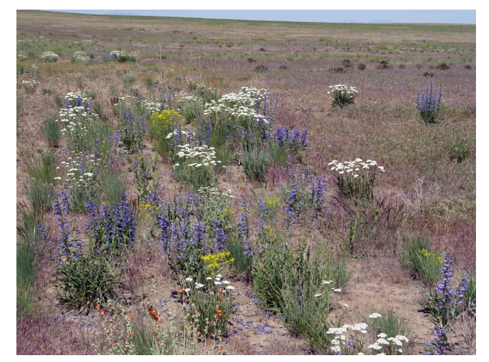
Figure 11. Royal penstemon in a post-fire study plot in southern Idaho.

Because of the low competitive ability of royal penstemon with cheatgrass (Parkinson 2008, Parkinson et al. 2013), it should be seeded in areas where cheatgrass seed density has been reduced by wildfire or other treatments and is not expected to recover rapidly (Ott et al. 2016b). To avoid competition with more rapidly growing seeded grasses and forbs having similar root morphologies, royal penstemon should be seeded in separate rows or areas, either alone or with other slow growing species with different rooting habits (Fig. 11; Parkinson 2008). This would reduce spatial overlap and interspecific competition for resources while increasing the diversity of species and life forms. Cane et al. (2007) suggested that royal penstemon pollinators Osmia brevis and O. penstemonis may have shallow underground nests, in which case they and the surface nesting Pseudomasaris vespoides would be susceptible to soil heating by wildfires (Cane and Neff 2011) or soil disturbance resulting from mechanical site preparation practices. Loss of specialist pollinators would restrict seeding of royal penstemon to areas near native vegetation that are likely to harbor the pollinators (Cane and Love 2016).