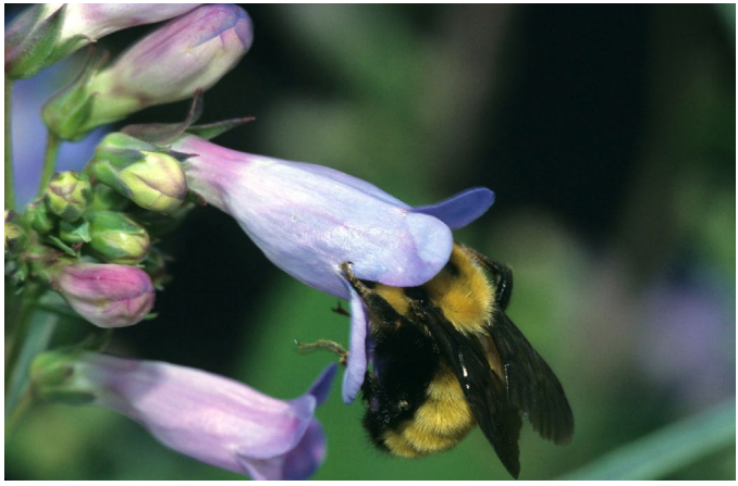
Figure 10. Royal penstemon flower pollinated by a bumblebee ( Bombus spp.).

Irrigation. Subsurface drip Irrigation requirements for royal penstemon were examined at OSU MES using subsurface drip irrigation (Shock et al. 2015b). This system provides precise application of water directly to the root system and away from crown tissues. This minimizes water use and reduces water availability to weed seeds. Drip lines were placed 12 inches (30 cm) deep between alternate rows (30-inch [76-cm] row spacing). Zero, 4, or 8 inches (0, 100, 200 mm) of supplemental water was added in four equal applications at 2-week intervals beginning with flowering. From 2006 to 2015, irrigation began between April 19 and May 20 ( \bar{x} = May 5) and ended between June 3 and June 5 (x = June 18). Seed yield of royal penstemon demonstrated a quadratic response to irrigation with the maximum response with 5 inches (130 mm) of irrigation. Irrigation of 4 to 8 inches (100-200 mm) supplemental water was recommended for warm, dry years, and none for cool, wet years (Shock et al. 2016).