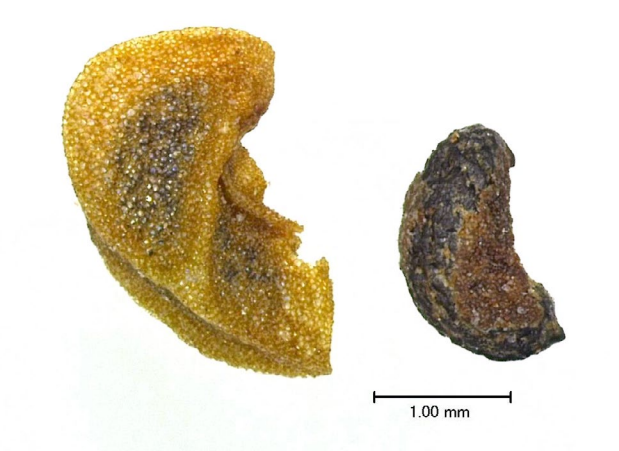
Figure 3. Royal penstemon seeds.