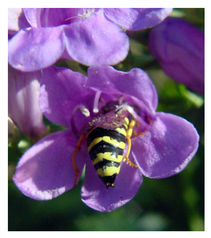
Figure 5. Royal penstemon visited by a solitary pollen wasp.

Pollination. Cane and Love (2016) inventoried pollinator abundance and diversity at native forbs used in restoration to estimate their "pollinator friendliness." Surveys were conducted at four Nevada sites in sagebrush steppe and its ecotones with pinyon-juniper woodlands. Solitary native bees of the genus Osmia (Mason bees) comprised half of the observed pollinators at royal penstemon (Cane and Love 2016), while the solitary pollen wasp (Pseudomasaris vespoides), which may sleep in the flowers at night (Nold 1999), accounted for 19.8% of the observed pollinators (Fig. 5). The remaining pollinators included the bee genera Anthophora (digger bees, 2.7%), Bombus (bumblebees, 8.1%), Ceratina (small carpenter bees, 0.9%), Halictus (sweat bees, 11.7%), Hoplitis (Mason bees, 1.8%) and Lasioglossum (sweat bees, 3.6%). Two Mason bees (Osmia brevis and O. penstemonis) and the solitary pollen wasp were pollen specialists