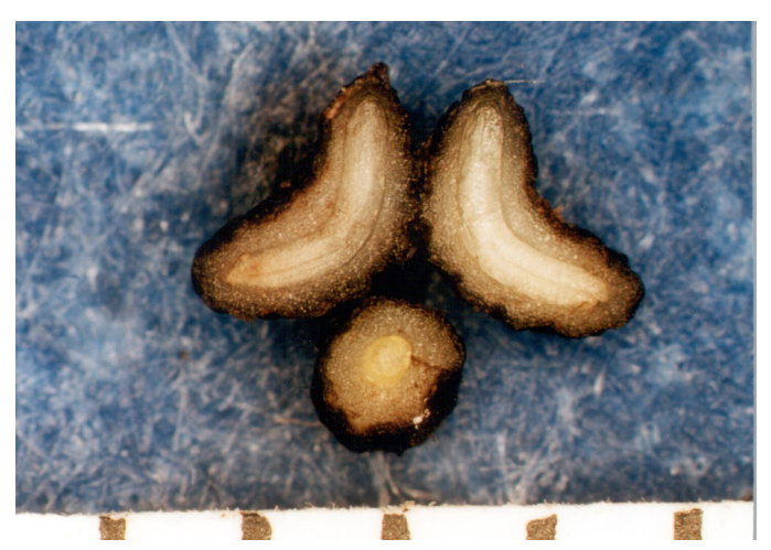
Figure 4. Royal penstemon seed: cross section and longitudinal sections. The embryo is surrounded by endosperm and the seed coat. Scale in mm.

Reproduction. Royal penstemon reproduces entirely from seed.