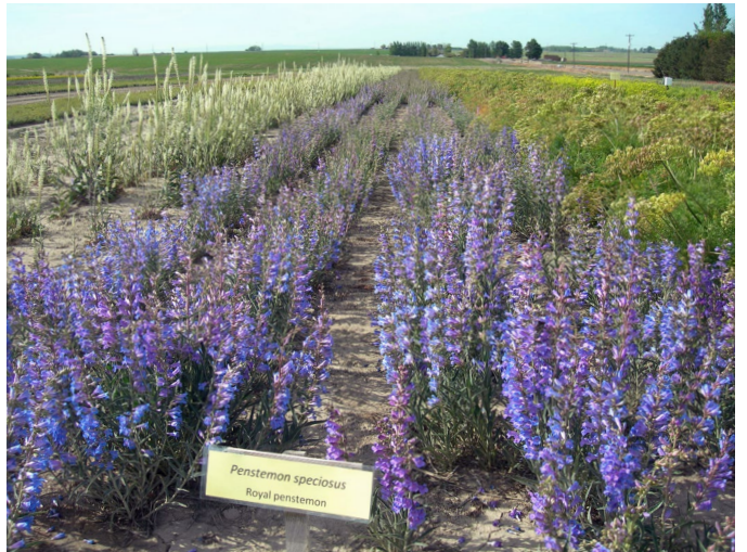
Figure 8. Royal penstemon irrigation test plots at OSU MES, Ontario, Oregon.

In 2013 establishment was improved (P < 0.05) relative to the control (0.1% stand) only by combinations that included row cover and seed treatment. The addition of sawdust or sawdust and sand did not result in further significant increases. The range for these treatments was 27 to 33.1% (Shock et al. 2014). In April 2014, only the combination of row cover, seed treatment, sawdust and sand (12.2% stand) improved stand compared to the control (0.7% stand) (P < 0.05) for plots planted in fall 2013 (Shock et al. 2015a).