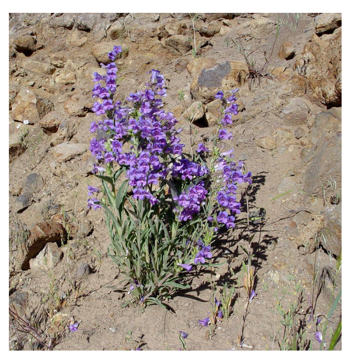
Figure 1. Royal penstemon plant in southeastern Oregon.

clasping, and folded lengthwise or flat (Cronquist et al. 1984; Hickman 1993). Leaves and stems may be purplish tinted. The inflorescence is an elongate, one-sided thyrse, an inflorescence with an indeterminate main axis and determinate subaxes (Fig. 1). There are sometimes thyrsoid branches from the lower nodes (Cronquist et al. 1984; Hickman 1993). Flowers are produced in 4 to 12 closely-spaced verticillasters (false whorls) along the inflorescence (Strickler 1997).