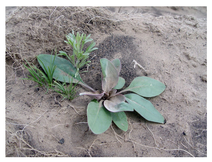
Figure 12. Royal penstemon seedling emerging from a postfire seeding in southern Idaho.

be planted in spots prepared to limit competition. Initial watering may be required for planted seedlings if the soil is dry.