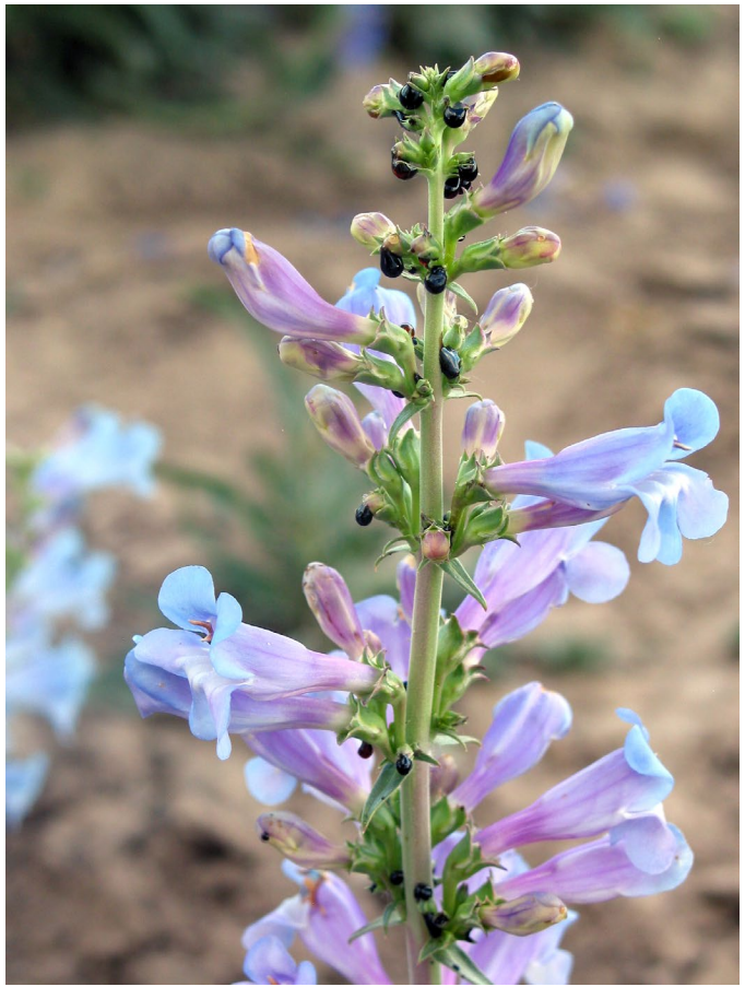
Figure 9. Royal penstemon "tears" (arrow). These are black tar-like drops produced near flower buds following lygus bug predation.

peak flowering for royal penstemon. Prolonged infestation and low seed set resulted from an early hatch in 2007 that was not adequately controlled by the insecticide treatment (Aza-Direct<sup>®</sup> [ai.: azadirachtin] at 0.0062 lb ai./ha, applied in May). Capture at 0.1 lb/acre and Orthene at 8 oz/acre (a contact and residual systemic) were applied during flowering or pre-flowering in subsequent years to control lygus bugs (Shock et al. 2016).