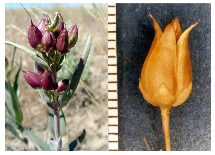
Figure 2. Royal penstemon with immature capsules (left) and mature capsule (right; scale in mm).

The fruit is a capsule, 0.2 to 0.6 inch (0.6-1.5 cm) long that opens apically. It becomes dry and parchment colored at maturity (Fig. 2). Seeds are brown, 2 to 2.5 (3.5) mm long, somewhat elongate and three-angled (Fig. 3; Cronquist et al. 1984; Hickman 1993; Hurd n.d). The embryo is slightly curved and embedded in living endosperm (Fig. 4; Hurd n.d.). Seeds are gravity dispersed.