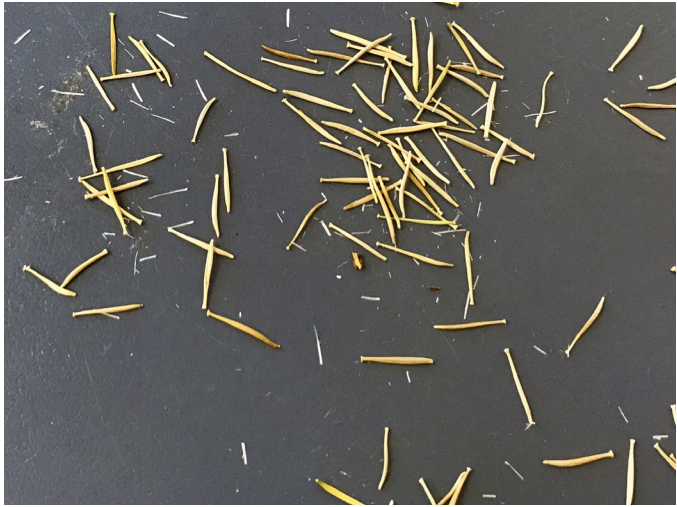
Figure 6. Sagebrush false dandelion seed after initial cleaning (above) and seed following final cleaning (below) at the USFS Bend Seed Extractory.

Wildland Seed Yield and Quality. The cleanout ratio (clean seed weight:rough weight of seed collection) for seed lots of sagebrush false