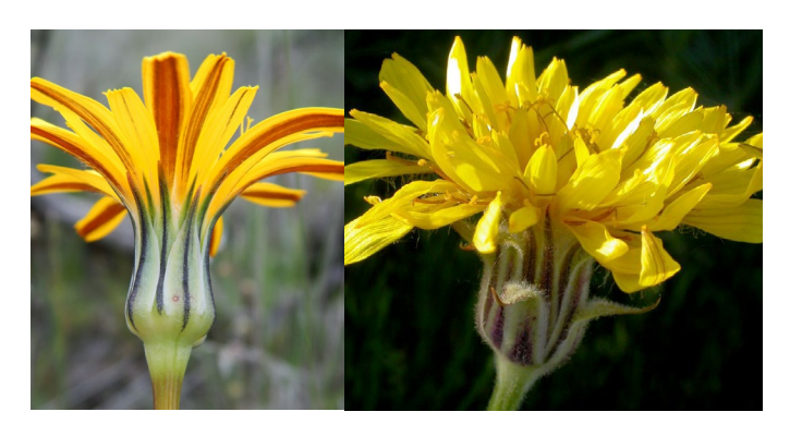
Figure 2. Sagebrush false dandelion flower heads with involucral bracts and ligulate ray florets.

Inflorescences (Fig. 2) are erect heads of 13 to 90 liqulate ray florets borne singly on each peduncle (Chambers 1993). Flower heads are each subtended by an involucre 0.6 to 1 inch (15-25 mm) wide consisting of 8 to 25 subequal, linear to lanceolate bracts (phyllaries) with the outer series shorter than or equal to the inner (Chambers 1993). The bracts are acuminate at the tip, green, sometimes with purple dots, and glabrous to white-hairy, especially on the margins and midrib, which is often purple (Cronquist 1955; Chambers 1993, 2006). The florets exceed the bracts. Liquies are yellow, sometimes with an orange midrib that may become pinkish with age. Florets may close early in the day during hot weather (Taylor 1992; Chambers 1993).