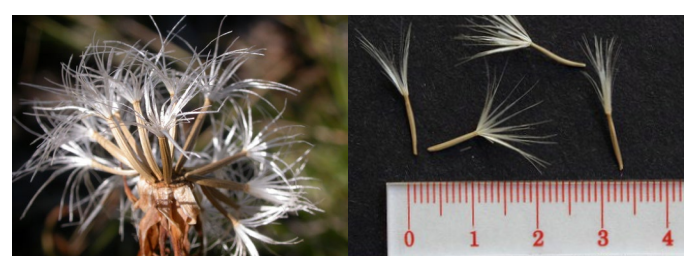
Figure 5. Mature fruits (cypselas, false achenes) of sagebrush false dandelion with pappus bristles. Note the lack of beaks on the fruits.

Post-collection management. Molding can occur if leaves and stems, which contain milky juice, are collected along with the seeds, particularly if collected during high humidity periods. Vegetative material should be removed promptly by hand or with sieves. Harvested seed should be spread on racks in a protected area and thoroughly air dried in the field or following transport to the cleaning facility. Collected material can be transported in clean, breathable bags or boxes and should be protected from overheating during transport. Insect infestations should be controlled by freezing collections for 48 hours or use of appropriate chemicals.