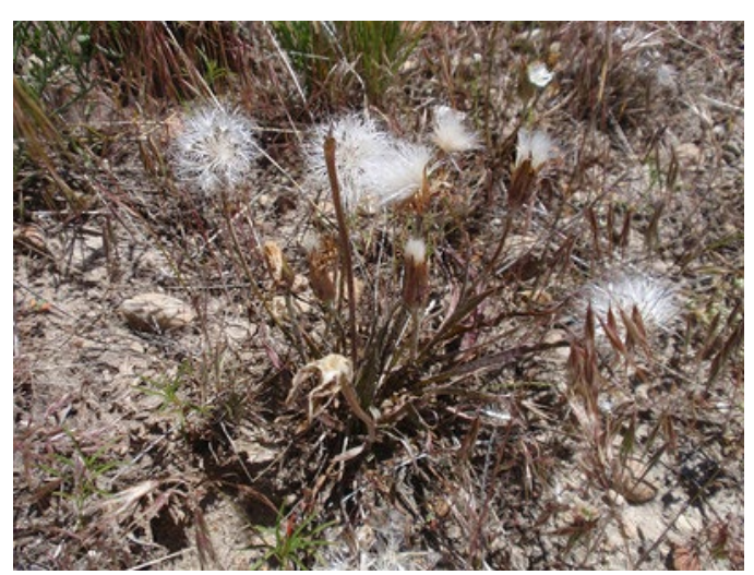
Figure 4. Sagebrush false dandelion plants with mature and dispersing seedheads illustrating uneven ripening.

Wildland seed certification. Wildland seed collected for direct sale or for establishment of agricultural seed production fields should be Source Identified through the Association of Official Seed Certifying Agencies (AOSCA) Pre-Variety Germplasm Program that verifies and tracks seed origin (Young et al. 2003; UCIA 2015). For seed that will be sold directly, collectors must apply for certification prior to making collections. Applications and site inspections are handled by the state where collections will be made. For seed that will be used for agricultural seed fields, nursery propagation or research, the same procedure must be followed. Seed collected by some public and private agencies