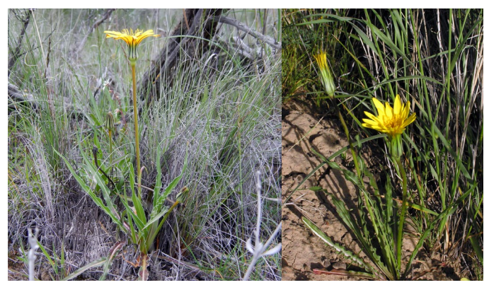
Figure 1. Sagebrush false dandelion plants in flower.

than 0.4 inches (1 cm) wide (Cronquist 1955; Munz and Keck 1973; Taylor 1992). Leaf surfaces are glabrous or villous, and the margins are often wavy and ciliolate (Cronquist 1955; Chambers 2006).