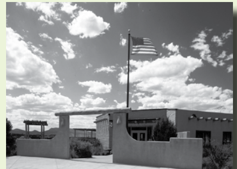
El Malpais Ranger Station is open seven days a week from 8:30 a.m.-4:30 p.m.

Check in with the Ranger Station, (9 miles south of I-40 on NM 117) for more information on this hike as well as other great hiking opportunities within El Malpais.