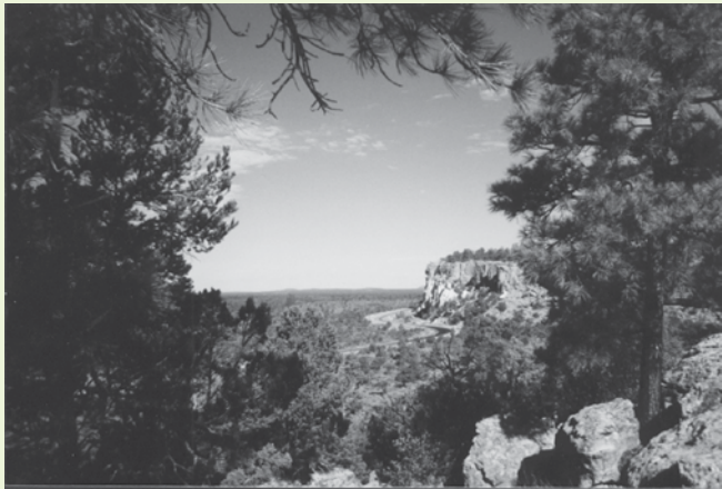
The views from the narrows rim are spectacular to say the least. Going to the far end, a distance of 3 miles, will result in excellent vistas.

Narrows Rim Trail gives hikers the opportunity to witness geologic processes, thousands of years apart. Stroll along the ancient mesa top and view the much younger lava flows below. This remarkable scenery of the lava beds and surrounding countryside ends with a picturesque view of La Ventana Natural Arch.