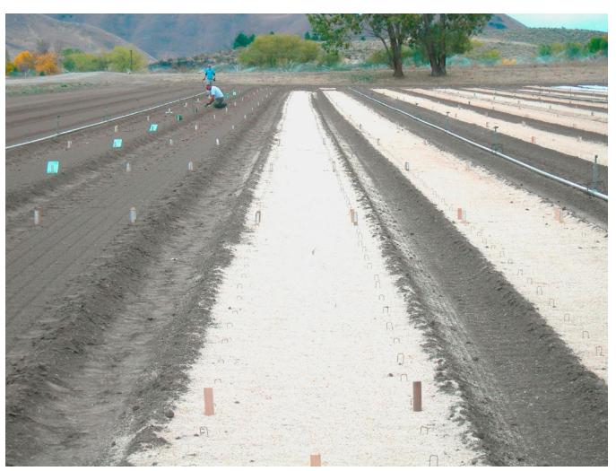
Figure 16. Site preparation for seeding fernleaf biscuitroot at USFS Lucky Peak Nursery (near Boise, ID). Beds at the center and on the right have already been seeded and covered with a thin layer of sand.

Aberdeen PMC and OSU MES. Good weed control was achieved using weed barrier fabric and hand rouging at the Aberdeen PMC (Ogle et al. 2012a). Non-selective foliar herbicide applications were used to control weeds after summer senescence of fernleaf biscuitroot (St. John and Ogle 2008; Ogle et al. 2012a).