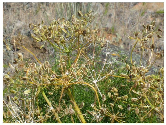
Figure 8. Fernleaf biscuitroot umbels with immature schizocarps.

Variety dissectum leaves are generally smaller (segments 2-8 mm long and 1.5-3 mm wide) than those of variety multifidum (2-22 mm long and 0.5-2 mm wide). Variety dissectum often produces maroon to purple flowers with 0.04 to 0.1-inch (1-3 mm) pedicles (Fig. 7), flowers can be yellow, but this is less common. Variety multifidum produces yellow flowers with 0.2 to 0.6-inch (5-15 mm) pedicles (Hickman 1993).