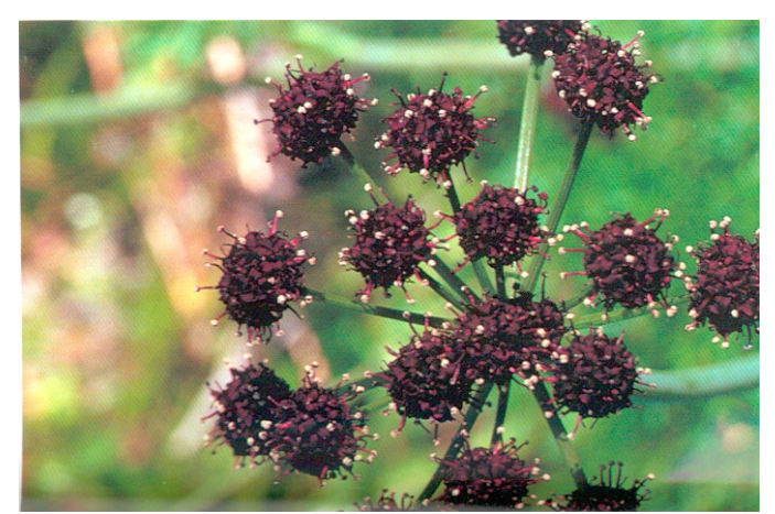
Figure 7. Lomatium dissectum var. dissectum with purple flowers, although they can be yellow.

1992). Schizocarps are flattened dorsally, oblong to oval, 0.4 to 0.6 inch (1-1.6 cm) long, 0.2 to 0.4 inch (0.4-1 cm) wide, and have flat-winged edges (Munz and Keck 1973; Hitchcock and Cronquist 2018). Schizocarps include two mericarps (seeds) that remain attached along their midlines until ripe. A single umbel can produce hundreds of seeds (Thompson 1985).