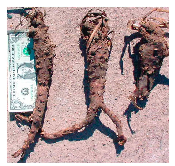
Figure 6. The thick, sometimes branching taproots of fernleaf biscuitroot support a stout caudex.

Flowers are produced in large compound umbels (Fig. 5) (Craighead et al. 1963). Peduncles (6-24 in [15-60 cm]) support umbels that are usually solitary (Welsh et al. 2016). Umbels produce 10 to 30 rays that vary in length from 1 to 5 inches (3-13 cm) long and are topped by umbellets (Munz and Keck 1973; Hickman 1993). Compound umbels are comprised of a combination of 50 to 200 male and bisexual flowers (Thompson 1998). All flowers are small, lack sepals, have five stamens, and five greenish yellow, yellow, or purple petals (Fig. 7) (Taylor 1992). Male flowers lack pistils and are common on the central, shorter rays (see Reproduction section) (Andersen and Holmgren 1976; USU Ext 2017). Bisexual flowers produce dry, two-seeded fruits (schizocarps) (Fig. 8) (Taylor