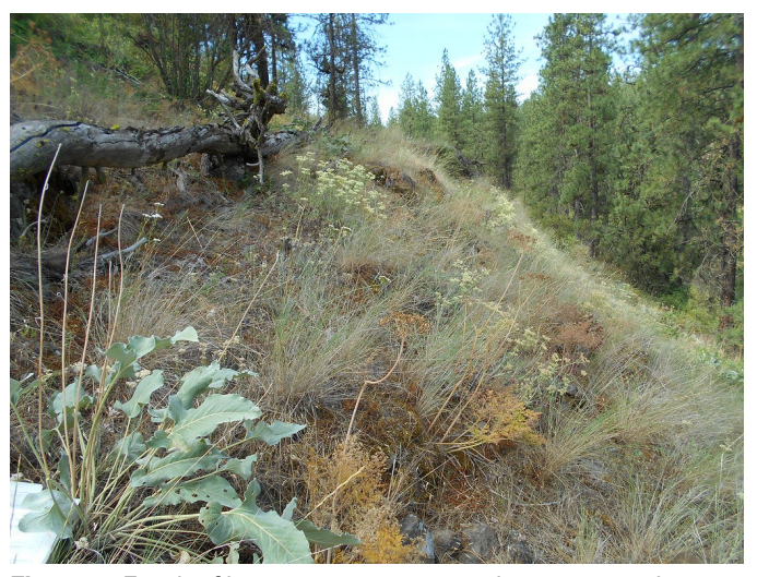
Figure 4. Fernleaf biscuitroot growing with grasses and arrowleaf balsamroot at the edge of a ponderosa pine forest in Oregon.

Soils. Fernleaf biscuitroot grows in a variety of soil types, including rocky to fine-textured and acidic to alkaline soils (USU Ext 2017; Hitchcock and Cronquist 2018). While a variety of soil conditions are tolerated, including high CaCO<sub>3</sub> levels (LBJWC 2015), it is most common in well-drained, dry, rocky soils particularly those on talus slopes (Craighead et al. 1963; Taylor 1992). Fernleaf biscuitroot grows well in soils with pH of 6.5 to 7.5 (Tilley et al. 2010).