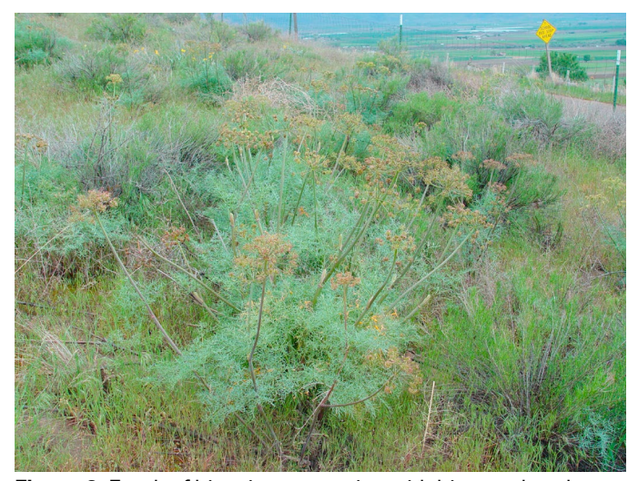
Figure 2. Fernleaf biscuitroot growing with big sagebrush, rabbitbrush, and cheatgrass near Homedale, ID.

In California, fernleaf biscuitroot occurs in rocky places in oak (Quercus spp.) woodlands, pinyonjuniper (Pinus-Juniperus spp.) woodlands, and mixed-conifer forests (ponderosa pine [P. ponderosa], California red fir [Abies magnifica], lodgepole pine [P. contorta]) (Munz and Keck 1973). In a study of soil, plant community, and climate relationships in south-central Idaho, fernleaf biscuitroot was a uniformly distributed, dominant species in basin big sagebrush (Artemisia tridentata subsp. tridentata) and antelope bitterbrush (Purshia tridentata) shrublands at Craters of the Moon National Monument. Here fernleaf biscuitroot production ranged from 394 to 513 lbs/acre (442-575 kg/ ha) over four years (Passey et al. 1982). In a survey of little sagebrush (A. arbuscula) and black sagebrush (A. nova) communities in northern Nevada, fernleaf biscuitroot constancy was 100% in little sagebrush-Thurber's needlegrass (Achnatherum thurberianum) communities and 40% in little sagebrush-Idaho fescue (Festuca idahoensis) communities. Fernleaf biscuitroot did not occur in black sagebrush-dominated shrublands (Zamora and Tueller 1973).