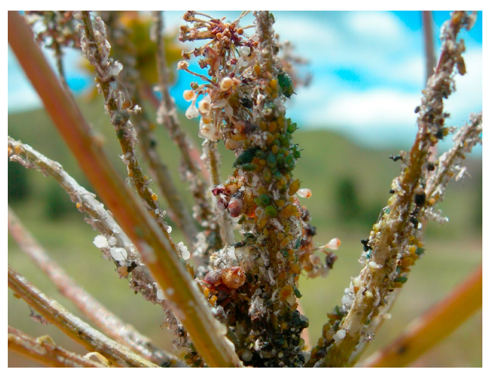
Figure 9. Fernleaf biscuitroot umbel covered with aphids at the USFS Lucky Peak Nursery near Boise, ID.

Fernleaf biscuitroot seed was taken by small mammals (Peromyscus spp.), darkling beetles (Eleodes nigrina), and others in field experiments at Smoot Hill Biological Reserve (Thompson 1985). Piles of 5 and 10 fernleaf biscuitroot and nineleaf biscuitroot [Lomatium triternatum]) seed were placed at 6.6-foot (2 m) intervals along three transects in mid-July 1981 and checked monthly. After 43 weeks (May 1982), just 9.1% of the seeds remained, and less than 2% of these seeds were intact, suggesting few seeds survive more than one winter. In experiments to determine if seed predators showed a preference between fernleaf and nineleaf biscuitroot species, piles of 300 seeds of both species were set out in mid-July 1983. All but 2 of 300 piles were discovered within the first month of trials. Significantly more fernleaf biscuitroot seed than nineleaf biscuitroot seed was taken (P < 0.001). Seeds were taken more rapidly from pure fernleaf biscuitroot piles than from pure nineleaf biscuitroot piles and fernleaf biscuitroot was preferentially taken from mixedspecies seed piles (P < 0.0001) (Thompson 1985).