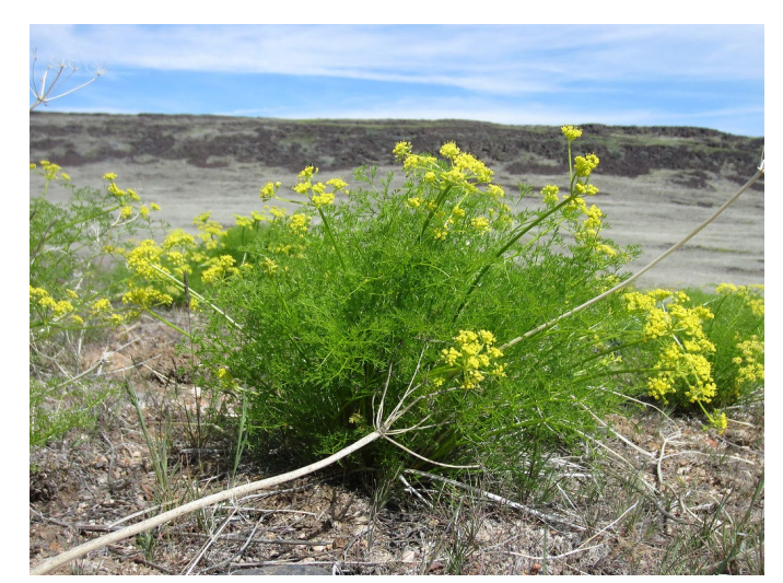
Figure 5. Fernleaf biscuitroot with bright green, heavily dissected leaves and tiny yellow flowers in a compound umbel.