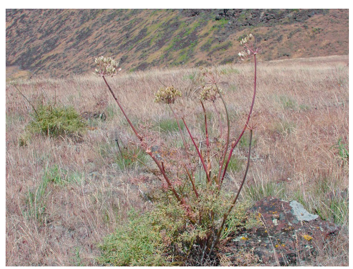
Figure 1. Fernleaf biscuitroot growing in a dry grassland near Craters of the Moon National Monument in south-central Idaho.

Habitat and Plant Associations. Fernleaf biscuitroot occurs in a variety of plant communities and environments ranging from rocky outcrops and dry open slopes to riparian habitats (Craighead et al. 1963; Hermann 1966; Andersen and Holmgren 1976; Crawford 2003). It is common in grasslands (Fig. 1), mountain meadows, sagebrush (Artemisia spp.) steppe (Fig. 2) and is also found in desert shrublands, woodlands, and forests. In the Inland Northwest, fernleaf biscuitroot is common in meadow steppe, shrub steppe, and mountain meadow vegetation (Fig. 3) (Pavek et al. 2012). In the Columbia Basin of Washington, it is common in streamside Oregon white oak (Quercus garryana)- and white alder (Alnus rhombifolia)-dominated woodlands that experience temporary flooding (Crawford 2003).