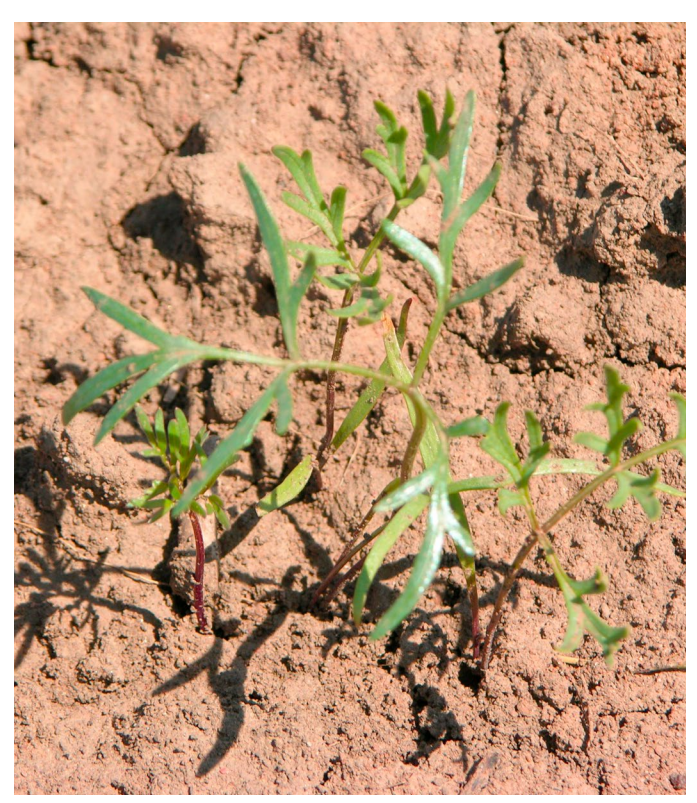
Figure 17. Fernleaf biscuitroot seedling growing at the Tom Day Farm in Layton, UT.

production plots. Taproots were not damaged, and plants survived transplanting well, suggesting this production method may be used by seed growers looking to minimize the area devoted to the species in its non-productive years (Tilley et al. 2010).