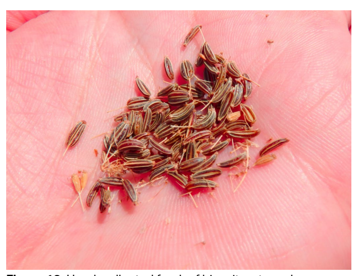
Figure 13. Hand-collected fernleaf biscuitroot seed. Schizocarps containing two seeds are visible.

3,431 feet (1,046 m) in Malheur County, Oregon. The latest collection was made on August 25, 2011 at 3,286 feet (1,002 m) in Boise County, Idaho. In the single year with the greatest number of harvests (18 collections in 2011) the earliest was June 14 at 3,143 feet (958 m) in Malheur County, Oregon, and the latest was August 25 at 3,286 feet (1,002 m) in Boise County, Idaho (USDI BLM SOS 2017), suggesting factors other than elevation are important to consider when estimating harvest dates. Regular monitoring of fernleaf biscuitroot populations is necessary for planning and maximizing fernleaf biscuitroot seed harvests.