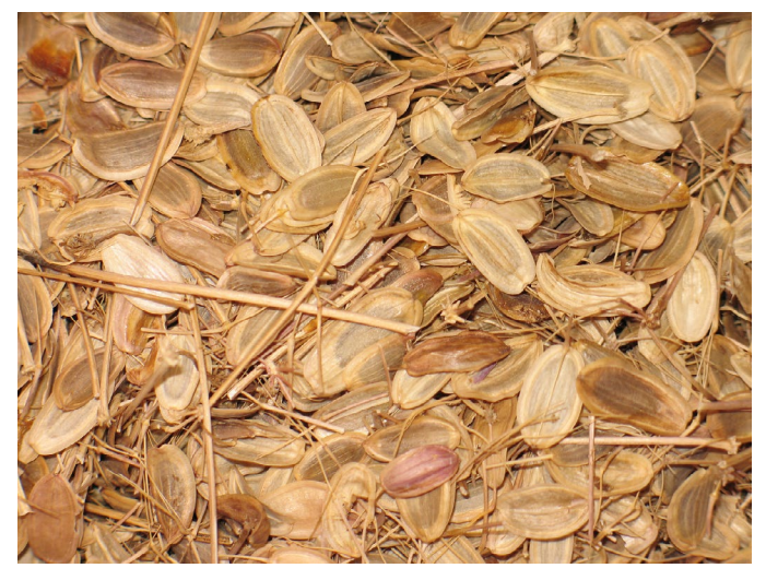
Figure 14. Bulk collection of fernleaf biscuitroot seeds.

seeds similar in shape and size to those of fernleaf biscuitroot.