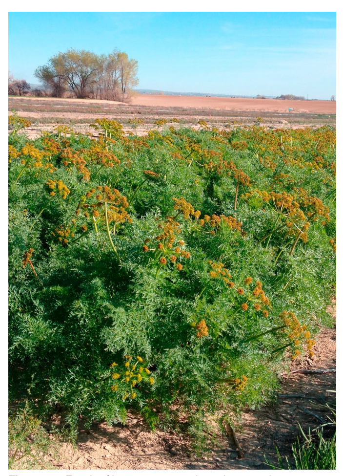
Figure 18. Fernleaf biscuitroot seed production plots at Oregon State University's Malheur Experiment Station near Ontario, OR.

Seed Yields and Stand Life. At OSU MES, fernleaf biscuitroot seed was harvested for 7 years (Fig. 18) (Shock et al. 2016). Seed yields averaged 475 lbs/acre (532 kg/ha) for non-irrigated stands, 923 lbs/acre (1,035 kg/ha) for stands receiving 4 inches (100 mm) of irrigation, and 968.5 lbs/ acre (1,085 kg/ha) for stands receiving 8 inches (200 mm) of irrigation. Seed production was significantly increased with irrigation (P < 0.05), but seed yields were rarely significantly different between the 4- and 8-inch (100 and 200 mm) irrigation treatments (Table 6). Seed yields showed a quadratic response to irrigation and were estimated to be highest with 13 to 17 inches (335-425 mm) of total applied water plus fall, winter, and spring precipitation (Table 9; Shock et al. 2016).