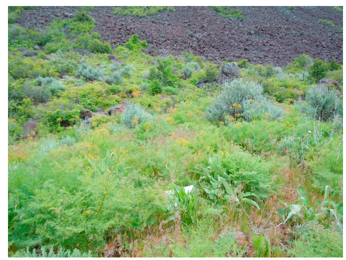
Figure 3. Fernleaf biscuitroot growing in a moist shrubland at the base of a scree slope.