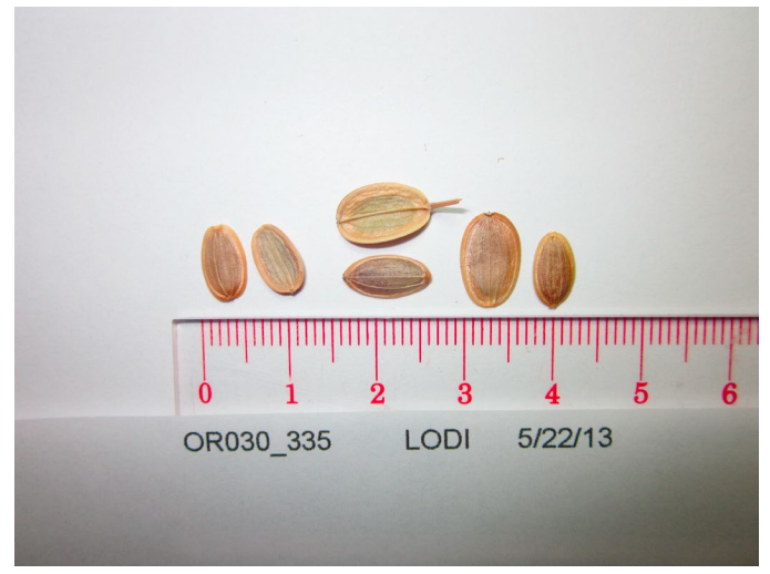
Figure 15. Fernleaf biscuitroot seed size variability. Scale is mm.

DeBolt and Parkinson (2005) rubbed fernleaf biscuitroot schizocarps through 0.5-inch (1.3 cm) square openings to remove fine debris and then processed the collection through a sieve with 3.4-mm square openings (No. 6 USA STS) (Fig. 15). Seed can be sorted over a light table to remove empty mericarps if necessary for nursery plantings.