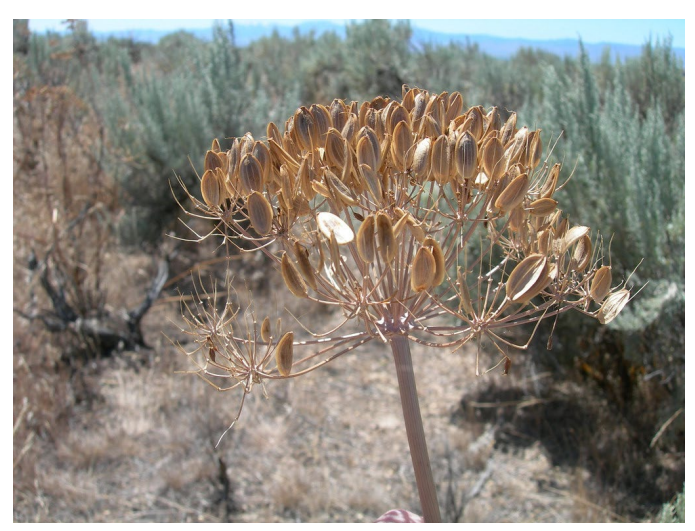
Figure 10. Single fernleaf inflorescence with some schizocarps attached but others dispersed.

Seed and Seedling Ecology. Controlled studies suggest that fernleaf biscuitroot may produce a seed bank (Scholten et al. 2009), although a proportion will likely be lost to predation (Thompson 1985, 1986). In experiments, viability was reduced but not lost to dehydration (Scholten et al. 2009). In this study, dehydration of imbibed seed was used to simulate spring drying of seeds to test the potential survival of ungerminated seed. Dehydration of seeds that were cold stratified for 10 weeks reduced seed viability from 96% to 61%. Seeds surviving dehydration did not germinate after being rehydrated but did germinate after 7 weeks of cold moist stratification. While final germination of dehydrated seed (33%) was much lower than that of control seeds (97%), 29% of ungerminated dehydrated seed remained viable but had deep dormancy, suggesting the potential for persistence in the seed bank. When fernleaf biscuitroot seeds were buried in mesh bags in mid-November, 31% of seed germinated by early March and 50% germinated by 2 June. Of the seed that remained ungerminated in the soil, 81% were viable. Viability decreased to 52% a month later, and to 30% by the start of fall (Scholten et al. 2009).