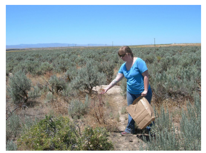
Figure 12. Hand collection of wild fernleaf biscuitroot seed.