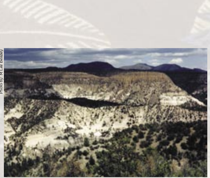
Juniper Woodland: Favored by the Gray Flycatcher and the Bewick's Wren in summer and by fruit-eating birds like the Townsend's Solitaire, American Robin, and Western Bluebird in winter.