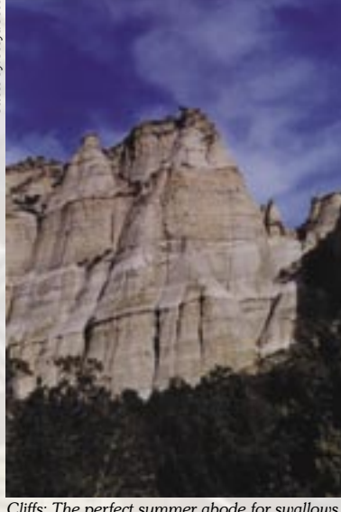
Cliffs: The perfect summer abode for swallows and swifts, as well as Rock and Canyon Wrens.