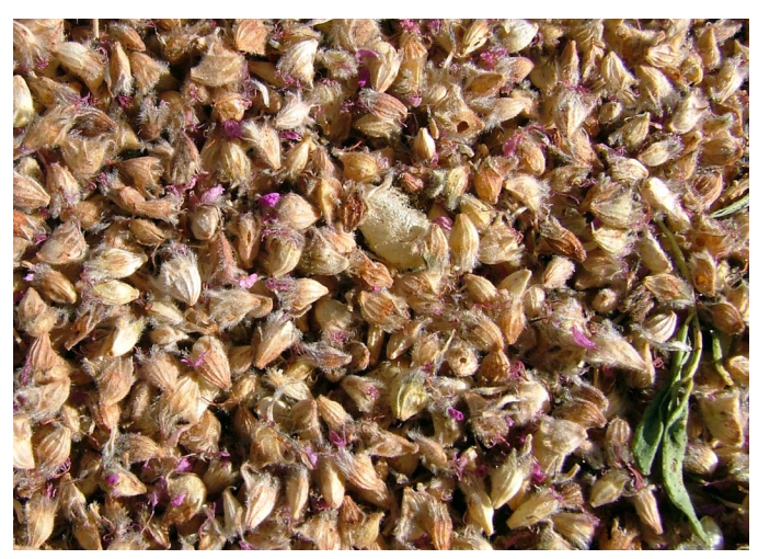
Figure 8. Bulk seed collection of prairie clover seed.

Post-collection management. Blue Mountain prairie clover is host to several seed-feeding insects. Measures to protect seed lots (Fig. 8) from insect damage are generally initiated immediately following harvest. Insecticidal strips are often placed in collection bags to reduce insect damage (Bhattarai et al. 2010). The SOS collection crews placed insecticide strips in each seed collection bag for 2 to 3 days while seed dried in open bags at room temperature (DeBolt and Barrash 2013). Seed-feeding beetles have been found in wildland and agricultural seed collections. Infestations can be detected by digital X-radiography of seed samples. There are several methods to treat insects without harming live seed. These include mechanical cleaning, fumigation, and abrupt freezing. For small wildland-collected seed lots (average size 22,800 seeds) beetles were killed with a conventional insecticide fumigant treatment of dichlorovos, which did not harm the seed (Cane et al. 2013).