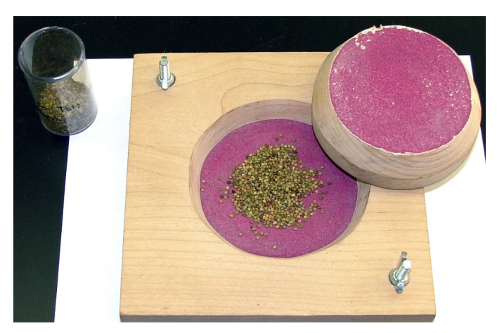
Figure 9. Apparatus used to mechanically scarify prairie clover seed with sand paper.

Germination. Blue Mountain prairie clover produces hard seeds that are physically dormant due to water impermeable seed coats. Low levels of germination (11-22%) can be expected without mechanical (Fig. 9) or acid scarification (Scheinost et al. 2009b; Bushman et al. 2015; Jones et al. 2016).