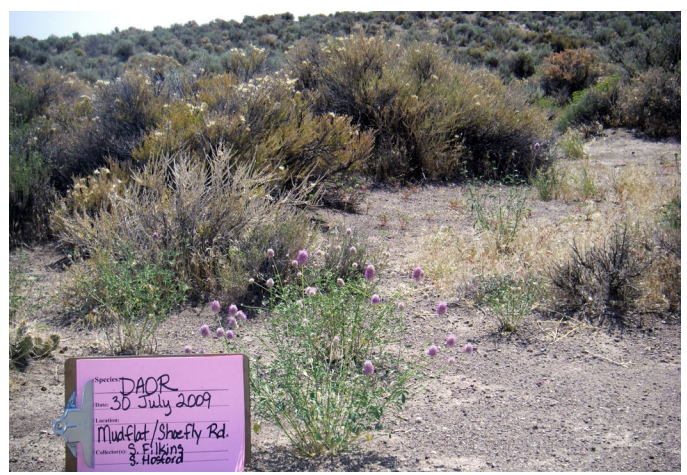
Figure 1. Blue Mountain prairie clover growing in sagebrush habitat in Idaho.

Soils. Soft clay and sandy soils from weathered basalt and volcanic ash are typical of Blue Mountain prairie clover habitats (Barneby 1977). Plants often occur on ash outcrops in Idaho and Oregon (DeBolt and Barrash 2013).