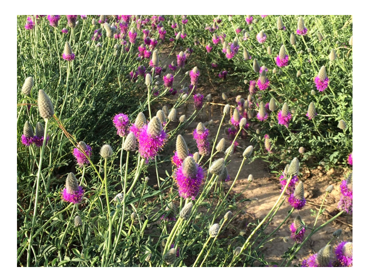
Figure 11. Blue Mountain prairie clover flowering in seed production plots growing at Oregon State University's Malheur Experiment Station near Ontario, OR.

Strong positive correlations have been reported between dry matter yield (DMY) and weight, and the number of inflorescences per plant, suggesting that selecting for high DMY would lead to greater seed yields (Bhattarai et al. 2010). For more on this common garden study, see Seed Sourcing section.