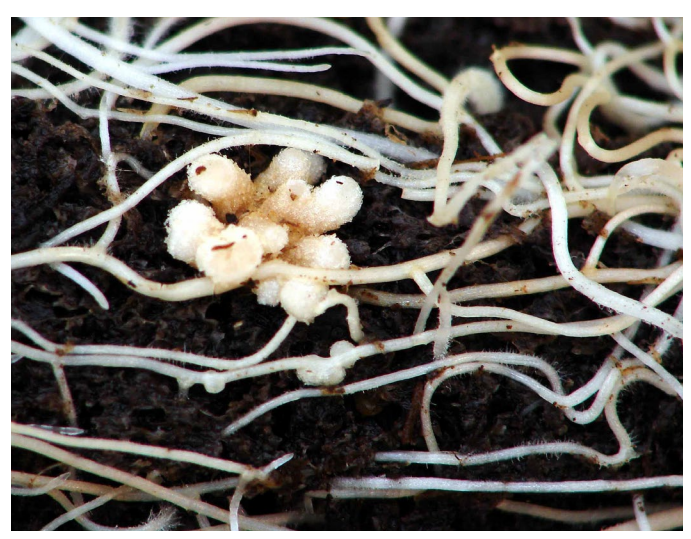
Figure 4. Root nodules on Dalea roots.

Below-Ground Relationships/Interactions. As is common with legumes, Blue Mountain prairie clover fixes nitrogen in association with rhizobial symbionts (Fig. 4) (Bushman et al. 2015).