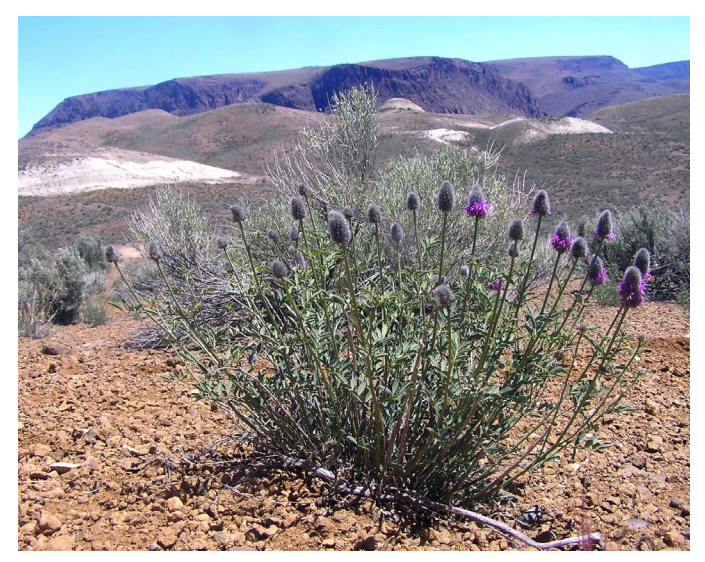
Figure 2. Blue Mountain prairie clover growing in the Succor Creek area of Oregon.

al. 2009a) with the terminal leaflet being the largest (Barneby 1977).