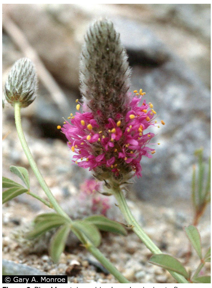
Figure 3. Blue Mountain prairie clover beginning to flower.