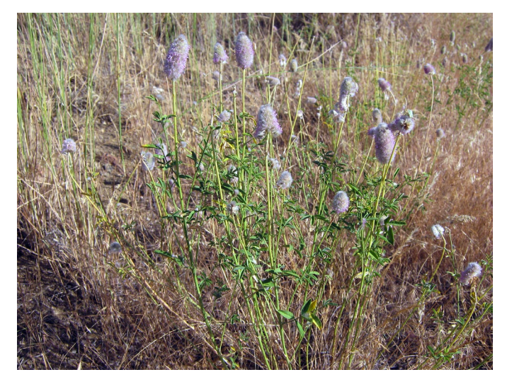
Figure 7. Blue Mountain prairie clover setting seed in Oregon.

is often immature or insect infested. Handstripped seed is typically easy to clean (M. Fisk, USGS, personal communication, 2018).