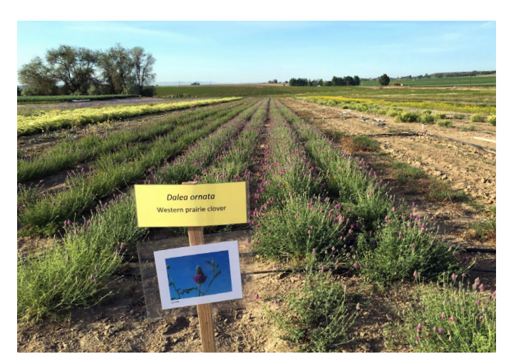
Figure 10. Blue Mountain prairie clover seed production plots growing at Oregon State University's Malheur Experiment Station near Ontario, OR.

produced in the second year and stands can be harvested for 6 years or more (Shock et al. 2017, 2018). Pollination by bees greatly improves seed yields when seed-feeding beetle populations are kept in check (Cane et al. 2012, 2013).