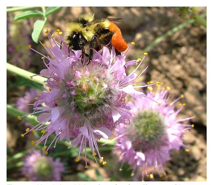
Figure 5. Hunt's bumblebee ( Bombus huntii ) visiting Blue Mountain prairie clover flowers in a common garden in Hyde Park, Utah.