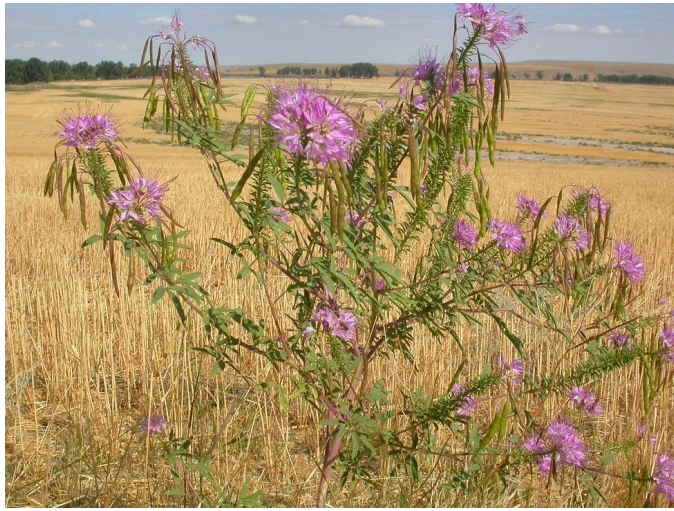
Figure 2. Rocky Mountain beeplant exhibits a rangy growth structure with branches developing from the upper part of the stem, dense inflorescences, and spreading capsules.

Rocky Mountain beeplant is a tall, upright, somewhat malodorous, colonizing annual plant growing 1 to 6.6 feet (0.3-2 m) tall with a 12- to 14-inch (30- to 35-cm) taproot. It produces dense racemes of purple to sometimes white flowers and elongate, spreading pod-like capsules (Fig. 2) (Currah 1983; Cane 2008; Welsh et al. 2015). Plants are erect with glabrous to glabrate stems that may branch above, creating an open, rangy structure. Leaves are alternate, glabrous or with marginal hairs when young, and palmate with three entire to slightly sinuate or serrulate leaflets 0.8 to 2.4 inches (2-6 cm) long and 0.2 to 0.6 inches (0.6-1.5 cm) wide. Leaflets range from lanceolate to elliptic or oblanceolate with mucronate to long acuminate tips (Holmgren and Cronguist 2005; Vanderpool and Iltis 2010; Welsh et al. 2015). Petioles have bristle-like stipules (Vanderpool and Iltis 2010).