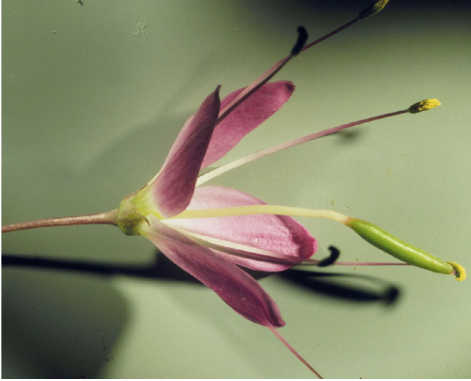
Figure 4. Perfect Rocky Mountain beeplant flower with the capsule beginning to develop.

stipes are more spreading and 0.4 to 0.9 inches (11-23 mm) long with the mature fruits pendulous. Mature viable seeds are 2.8-4 mm x 2.5 to 3 mm, dark brown to black, and spherical to ovoid or horseshoe-shaped with rough surfaces (Fig. 5) (Currah et al. 1983; Holmgren and Cronguist 2005; Vanderpool and Iltis 2010; Winslow 2014). Fruit size variation has been attributed to environmental rather than genetic causes (Iltis 1952 in Vanderpool and Iltis 2010). Seeds reportedly lack or contain only small amounts of endosperm (Iltis 1958; Sanchez-Acebo 2005). The embryo is curved and folded (Iltis 1958). Flowering dates depend on the location, but across the species' range, flowering may occur from May to October (Iltis 1958; Munz and Keck 1973; Holmgren and Cronguist 2005).