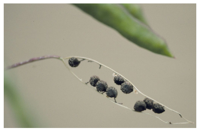
Figure 6. Seeds dispersing from the placenta (replum) after the valves of the capsule have fallen away.

Flowering and fruiting phenology. Rocky Mountain beeplant flowers over a period of several weeks from late spring to mid-summer depending on location. In southern Alberta plants emerge in May, flower buds are produced in June, flowering occurs from June to September, seeds ripen from July to September, and plants die in October (Currah et al. 1983). Flowering begins at the base of the inflorescence and inflorescence branches and proceeds upward as the inflorescence elongates. Thus, older perfect flowers are pollinated, develop capsules, and disperse seed while new flowers continue to develop (Iltis 1958; Munz and Keck 1973; Holmgren and Cronguist 2005). Dehiscence of mature capsules occurs when the two halves (valves) of the capsule separate from the loop-shaped placenta (replum), which remains on the plant and dehisces separately (Fig. 6) (Iltis 1958). Seeds then begin dispersing from the placenta.