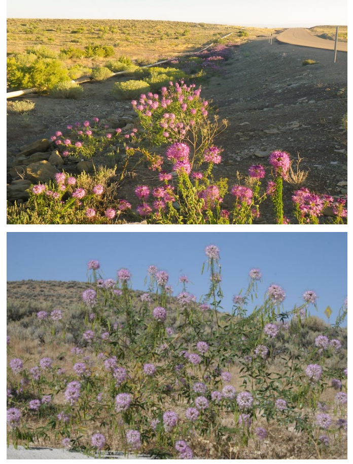
Figure 1. Rocky Mountain beeplant growing in Utah along a roadside (top) and in the Owyhee mountains of Idaho (bottom).

sagebrush ( A. tridentata ) (Winslow 2014). Beatley (1976) reported it in lowland shadscale ( Atriplex confertifolia ) vegetation on basin floors in closed drainage basins at elevations of 5,000 to 5,200 feet (1,524-1,585 m) in Nevada.