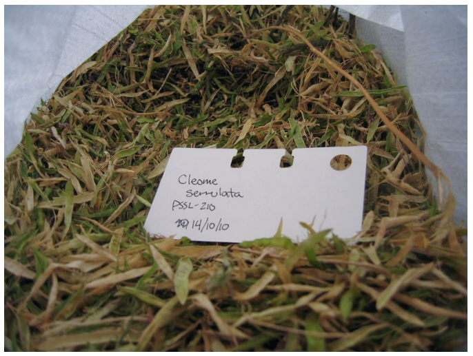
Figure 8. Harvested Rocky Mountain beeplant prior to cleaning consists of capsule valves, seed, and fine debris.

The remaining material is put on a finishing machine. Larger amounts are conditioned on an Office Clipper with a round screen (size 6 to12 as appropriate) on top to remove stems and pod material and the air is set at 1 to 5 to separate smaller pod pieces and empty seed. If the amount of material is small, the seed is put on a continuous seed blower (CSB) (Mater Seed Equipment, Corvallis, OR) to separate filled seed from the empty seed and remaining pod material. Air is set from 300 to 400 depending on seed size (K. Herriman, USFS Bend Seed Extractory, personal communication, January 2020).