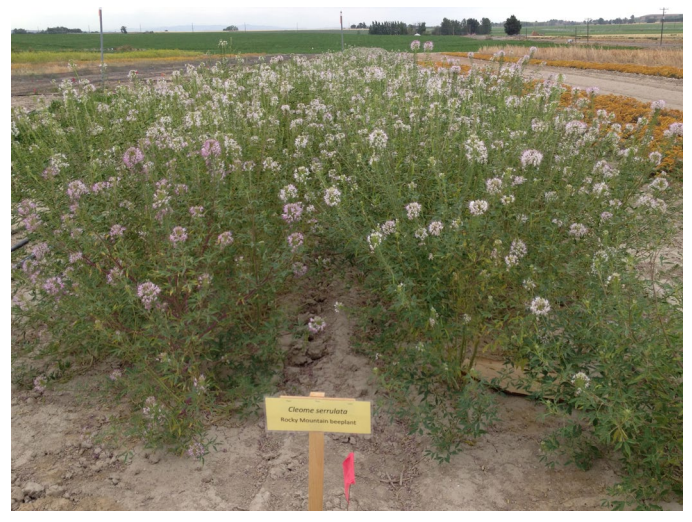
Figure 9. Rocky Mountain beeplant irrigation research plots at the Oregon State University Malheur Experiment Station, Ontario, Oregon.

In 2011 seed yield increased with irrigation up to 8 inches (200 mm) (Table 6), but there was no response to irrigation from 2012 to 2018. Accumulated degree-days were lower than average in 2011, but above average from 2012-2018, suggesting that the lower temperatures favored continued flowering and seed set (Shock et al. 2019).