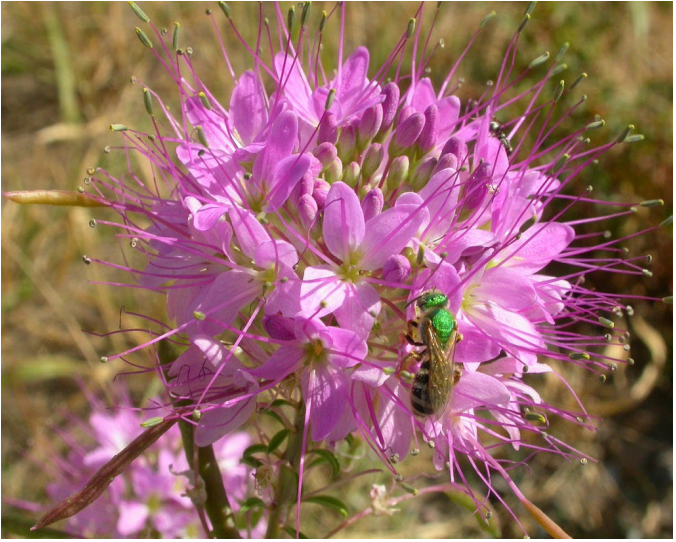
Figure 3. Densely flowered, indeterminate Rocky Mountain beeplant inflorescence with darker colored buds at the apex and flowers and capsules further down the raceme. Note the exerted stamens with green anthers and pink filaments.

Rocky Mountain beeplant produces perfect and pistillate flowers. Perfect flowers have both stamens and a pistil. Staminate flowers begin as perfect buds, but pistil formation is incomplete, thus flowering is not andromonoecious (with staminate and perfect flowers on the same plant) because truly staminate flowers are not produced (Cane 2008). Flowers produce six long, equal, threadlike stamens with purple filaments and green anthers that are exserted as the flower opens (Fig. 4). The pistil of perfect flowers has a basal gland and unilocular ovary with two parietal placentae. The stamens and pistil arise from an androgynophore (stipe) (Blackwell 2006; Vanderpool and Iltis 2010) that is 0.04 to 0.6 inch (1-15 mm) long in fruit (Munz and Keck 1973; Holmgren and Cronquist 2005; Vanderpool and Iltis 2010; Welsh et al. 2015).