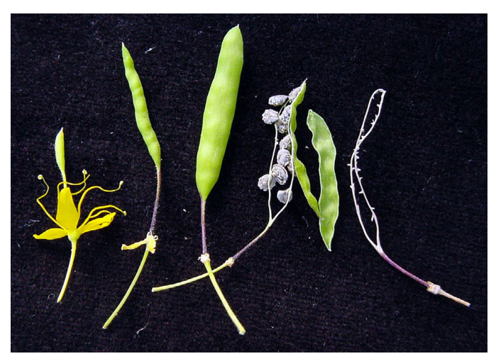
Figure 5. Yellow bee-plant flowers, fruits, and seeds. From left to right: perfect flower, immature and mature fruits (pods), fruit with the valves removed leaving the loop-like placenta (replum) and seeds, and placenta with the seeds removed.

Racemes alternate between production of perfect and staminate flowers as has also been noted for C. spinosa (spiny spiderflower) (Murneek 1927; Cane 2008). Staminate flower production increases when racemes are producing large numbers of fruits that require high resource input. Thus, flowering continues throughout the season, alternating between the two flower types, and fruit production occurs over a prolonged period (Cane 2008).