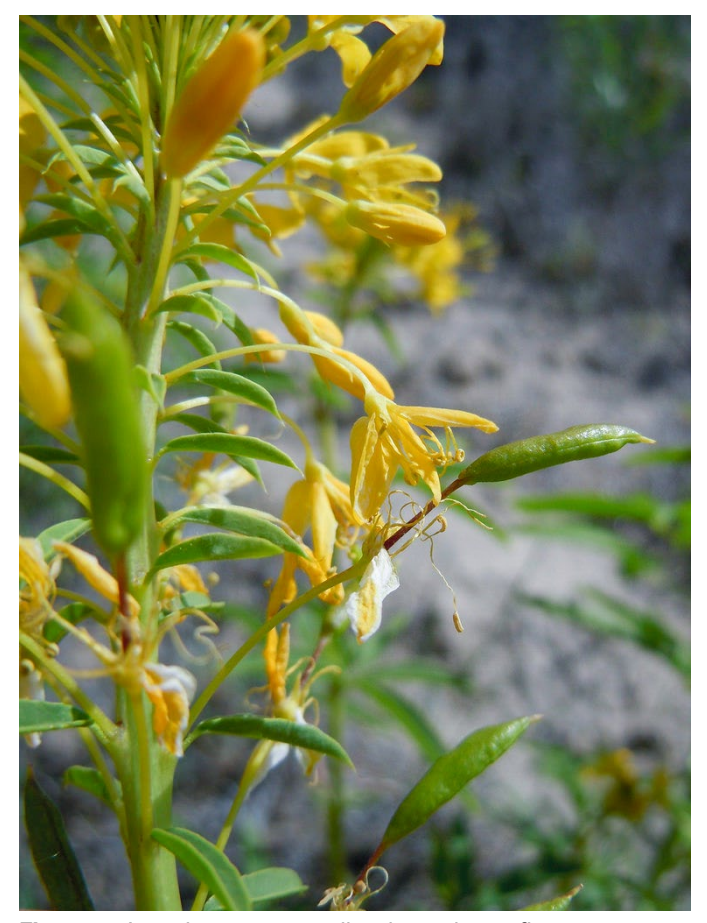
Figure 4. An indeterminate yellow bee-plant inflorescence with immature fruits near the base and progressively less mature flowers toward the apex.

their petals, develop pods, and disperse seed while new flowers continue to open near the apex of the elongating inflorescence. Dehiscence of mature fruits occurs when the two halves (valves) of the pod separate from the loop-shaped placenta (replum), which remains on the plant and dehisces separately (Iltis 1958). Seeds then begin dispersing from the placenta (Fig. 5).