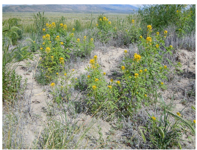
Figure 7. Early successional yellow bee-plant growing with few other species.

Yellow bee-plant is an early successional colonizer that often grows with few other species on fine- to medium-textured, well-drained soils of disturbed sites in western shrublands (Fig. 7). It spreads readily from seed, grows rapidly, and produces flowers that are both self-fertile and outcrossing. Yellow bee-plant flowers over a long period and hosts a wide array of pollinators, thus supporting pollinator populations for other species (Baker and Stebbins 1965). Flowering, seed production, and population size appear to fluctuate annually, depending upon local precipitation (Cane 2008; S. Jackman, OWPR, personal communication, February 2019). Seedlings may be frost sensitive (PFAF 2019), and plants are apparently not tolerant of competition (Pellett 1940).