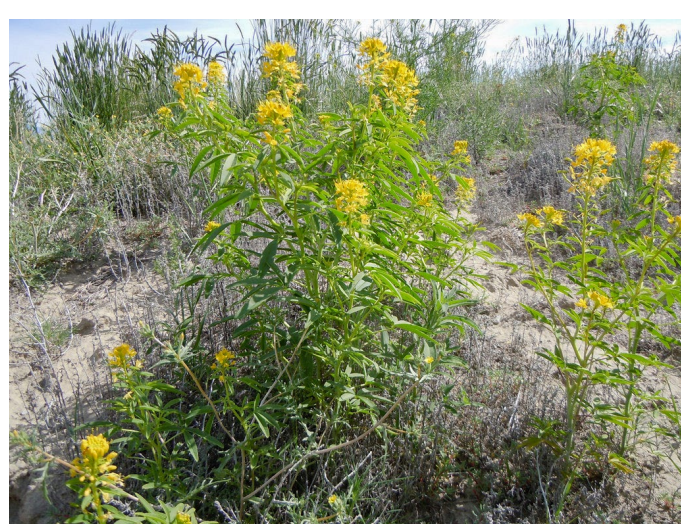
Figure 2. Yellow bee-plant growth habit showing the widely separated leaves and brush-like inflorescence.

The showy inflorescences are terminal racemes that produce densely crowded yellow flowers (Iltis 1958; Holmgren and Cronquist 2005). Bracts on the racemes are simple and much smaller than the stem leaves. Flowering is highly indeterminate, beginning at the base of the raceme and proceeding upward as the raceme elongates to about 16 inches (40 cm) in fruit (Cane 2008; Vanderpool and Iltis 2010).