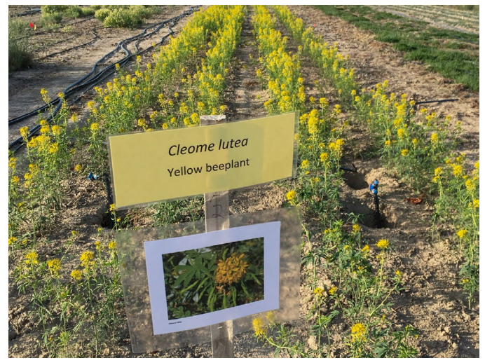
Figure 10. Yellow bee-plant irrigation trial at the Oregon State University Malheur Experiment Station, Ontario, Oregon.

Seed Harvesting. Seed can be harvested using a vacuum harvester or by swathing and allowing the swathed material to dry for a week before harvesting the seed (Tilley et al. 2012). At OSU MES, research plots were harvested manually two to four times each year (Shock et al. 2017b). Multiple non-destructive harvests increased total seed yield and its genetic diversity by harvesting seed from all stages of flowering.