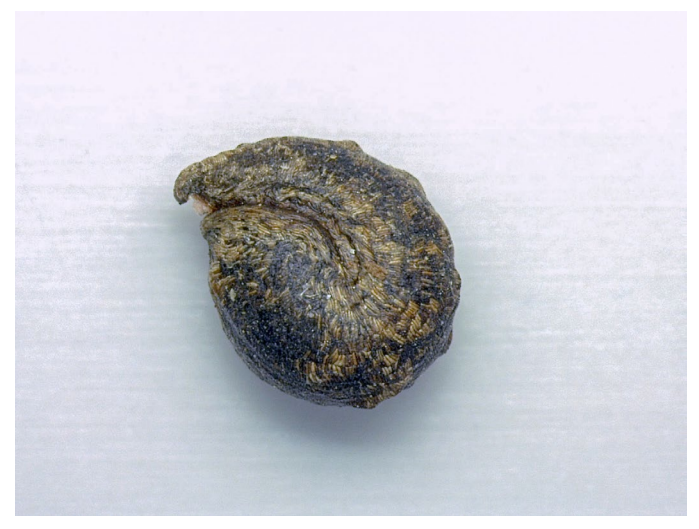
Figure 6. Mature, dark, yellow bee-plant seed.

Breeding system. Cane (2008) found that yellow bee-plant flowers of open-pollinated plants produced two to three times as much fruit as caged plants that received one of three artificial pollination treatments. Caged plants were manually fertilized to compare same flower fertilization (autogamy), fertilization with pollen from a different flower on the same plant (geitonogamy), and cross-pollination (xenogamy). Similar proportions of flowers set fruits in each of the three treatments, indicating that perfect flowers were fully self-fertile. Average counts of viable (dark-colored) seeds (Fig. 6) per silique were comparable across all four treatments (Cane 2008).