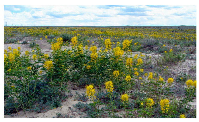
Figure 1. A large population of yellow bee-plant growing in open, disturbed habitat typical for the species.

Populations of yellow bee-plant occur in shadscale ( Atriplex confertifolia ), sagebrush ( Artemisia spp.), horsebrush ( Tetradymia spp.), greasewood ( Sarcobatus vermiculatus ), creosote bush ( Larrea tridentata ), riparian, pinyon-juniper ( Pinus-Juniperus spp.), and ponderosa pine ( P. ponderosa ) communities (Munz and Keck 1959; Vanderpool and Iltis 2010; Ogle et al. 2012; Tilley et al. 2012; Calflora 2018; Granite Seed 2019). The species spreads quickly from seed and may develop large populations on recent disturbances (Taylor 1992; Cane 2008; Ogle et al. 2012; Granite Seed 2019; LBJWC 2019).