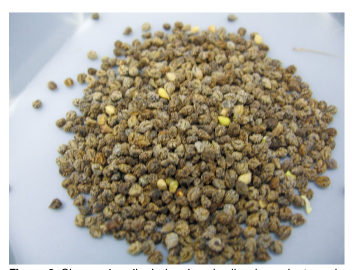
Figure 9. Clean, primarily dark colored yellow bee-plant seed.

Nursery, seed lots are first run over a scalper with top screen no. 8 and bottom screen no. 1/16. Screen sizes may require some adjustment for individual seed lots. Fine cleaning is accomplished using a Missoula dewinger (USFS Missoula Technology and Development Center, Missoula, MT) with feeder speed 4, drum speed 6, angle 8, and the air closed to remove fine chaff and non-viable seed (usually light colored) (USFS LPN 2017). At the USFS Bend Seed Extractory, large stems are removed by hand. Seed is then sieved from the seed lot using soil sieve screens, usually numbers 4, 5, or 6 to remove the pod valves and other coarse material. A Westrup LA-P de-awner (Westrup A/S, Slagelse, Denmark) is then used to break up remaining pod material and release any seed that remains in the pods. The seed lot is then sieved again to remove free seeds. If any seed remains in the pod material at that point, another cycle of de-awning and sieving is conducted. After each step, freed seeds are removed to reduce the risk of mechanical damage by repeated abrasion as well as the quantity of material yet to be cleaned (K. Herriman, USFS Bend Seed Extractory, personal communication, March 2019).