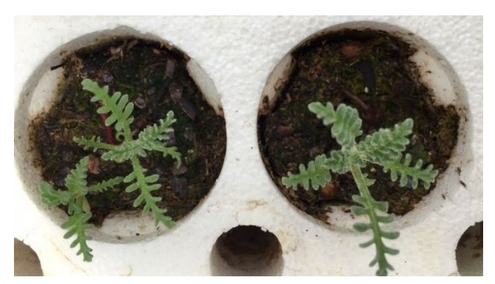
Figure 7. Container-grown Douglas' dustymaiden seedlings.

Container plants were produced in Boise, Idaho, by placing sown containers outside in December (DeBolt and Barrash 2013). Emergence began after 2 months and was complete after 4 months. Seedlings were transferred to 5.5-inch containers when secondary leaves developed. Seedlings were grown outside for 6 months, and when observed, flower stalks were removed to promote vegetative growth. Seedlings were outplanted in October.