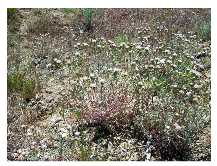
Figure 1. Douglas' dustymaiden in natural rangeland habitat.

Douglas' dustymaiden was common on silver mine dumps near Park City, Utah, visited about 45 years after the end of surface mining operations (Alvarez et al. 1974). It occurred on sites where average midJuly soil temperature averaged 62.2° F (16.8 °C) at 15 inches (38 cm) deep, phosphorous levels averaged 784 \mu g/300 cc of soil, and calcium levels averaged 376 mg/300 cc of soil. Density of the species increased significantly (P = 0.01) with increasing soil phosphorus (Alvarez et al. 1974). On sulfide-bearing waste areas left from copper pit mining operations at the Bingham Canyon Mine in Utah, Douglas' dustymaiden occurred on both saline (0.06-0.5 dS/m) and low to neutral pH (4.2-7.9) soils (Borden and Black 2005).