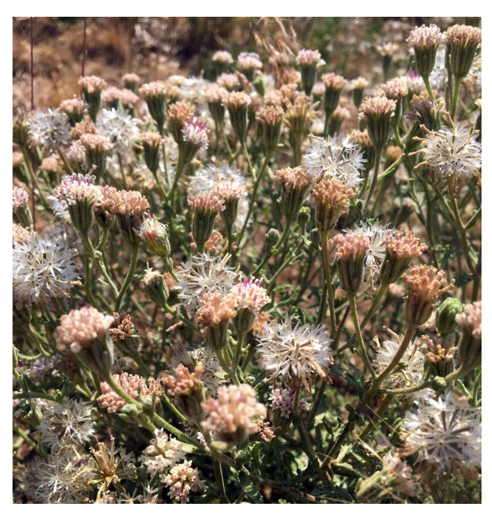
Figure 5. Uneven seed ripening is typical for Douglas' dustymaiden.

Estimates of seed maturation and fill to determine adequacy of sites for collection and collection timing can be made using a cut test or X-ray test. The 'pop test' described by Tilley et al. (2011) may be a useful predictor of seed fill (See Seed Testing section).