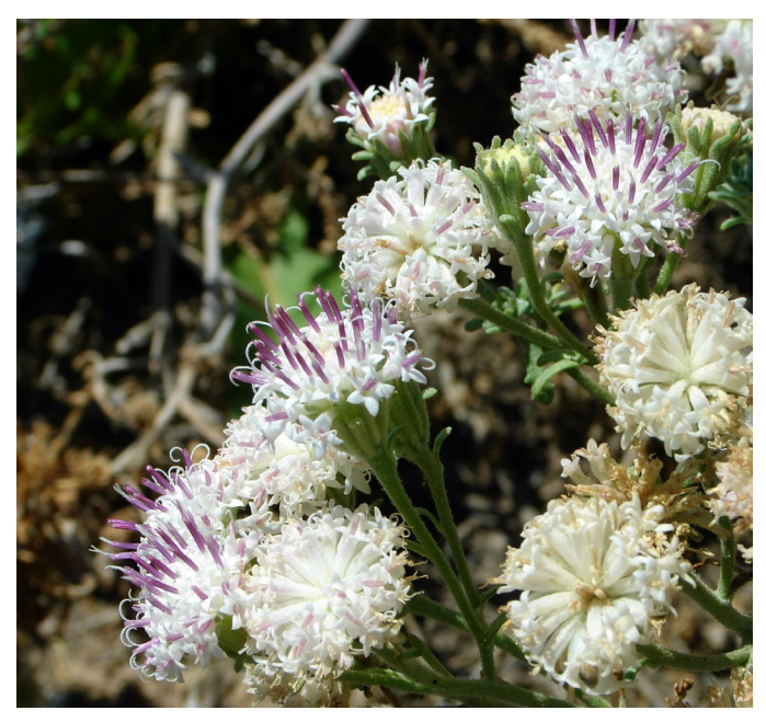
Figure 2. Douglas' dustymaiden flowers.

Flowering is indeterminate and occurs in the first year (Shock et al. 2014c). Flowers can be found anytime from April to September in the Intermountain West (Anderson and Holmgren 1976; Cronquist 1994; Parkinson and DeBolt 2005). Flowers in June and July are most typical (LBJWC 2017).