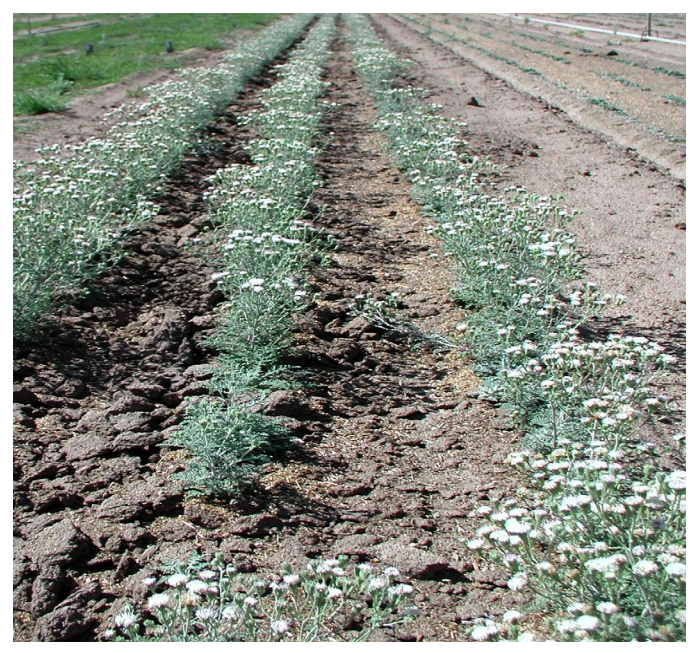
Figure 6. Douglas' dustymaiden seed production plot at the USFS Lucky Peak Nursey.

Program for native field certification for native plants, which tracks geographic origin, genetic purity, and isolation from field production through seed cleaning, testing, and labeling for commercial sales (Young et al. 2003; UCIA 2015). Growers should use certified seed (see Wildland Seed Certification section) and apply for certification of their production fields prior to planting. The systematic and sequential tracking through the certification process requires pre-planning, understanding state regulations and deadlines, and is most smoothly navigated by working closely with state regulators.