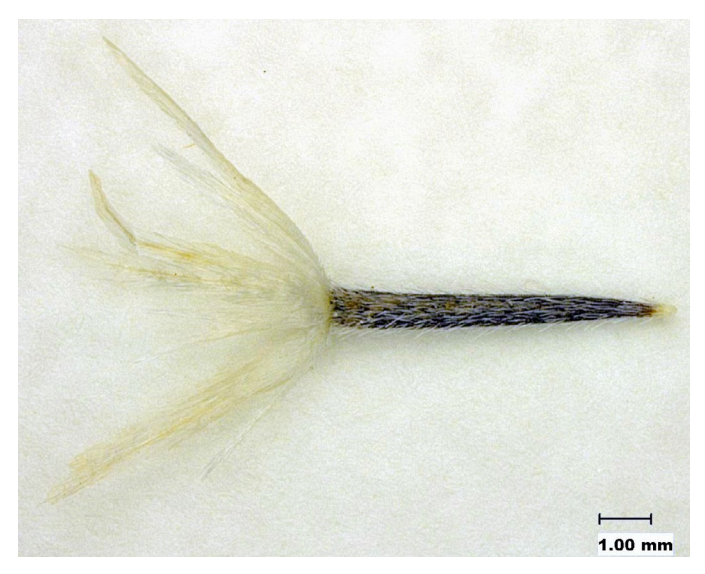
Figure 3. Douglas' dustymaiden achene with pappus.