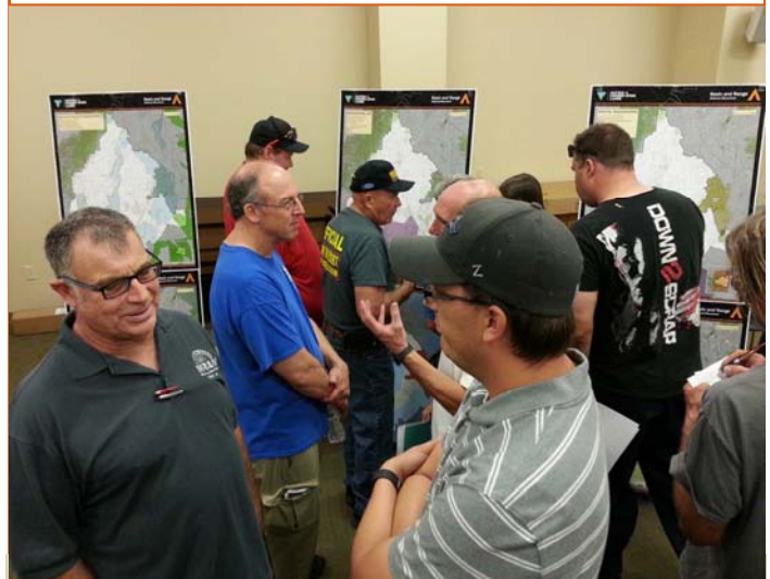
Members of the public and BLM staff attending the Basin and Range National Monument scoping meeting held in Las Vegas on June 29, 2016.