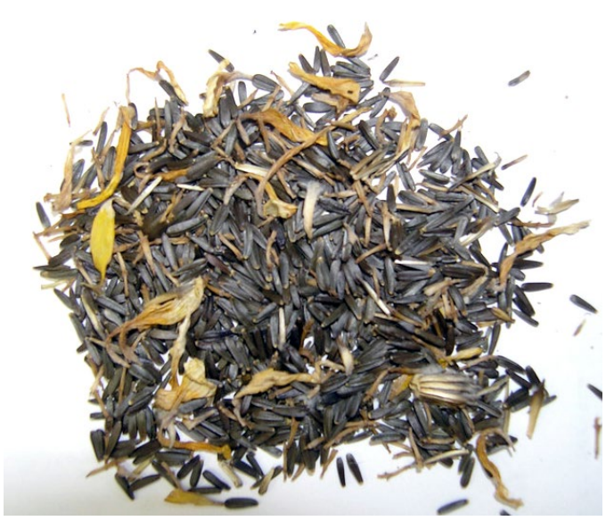
Figure 10. Collection of arrowleaf balsamroot seeds. Note appearance of petals at collection time.

Collection rates. Monsen (USFS retired, personal communication, March 2018) estimated 150 lbs (68 kg) of seed could be hand collected by 2 or 3 people over 2 or 3 days.