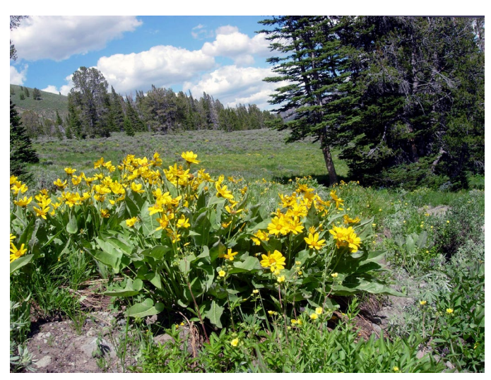
Figure 2. Arrowleaf balsamroot growing in mixed-conifer forest openings in central Idaho.

Woodlands. In open, low- to mid-elevation conifer (Fig. 2) and quaking aspen woodlands, arrowleaf balsamroot can be abundant. It is a characteristic species of western juniper ( J. occidentalis )/big sagebrush/bluebunch wheatgrass rangeland types (Shiflet 1994). In the Steens Mountains of southeastern Oregon, it was positively associated with increasing soil moisture in western juniper encroached vegetation on south-facing slopes when stands across a heterogeneous landscape were evaluated (Peterson and Stringham 2009).