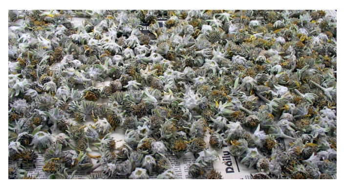
Figure 9. Collection of arrowleaf balsamroot seed heads.

and 10; Stevens and Monsen 2004; Camp and Sanderson 2007). When nearly pure stands of arrowleaf balsamroot occur on level terrain, combines or other reel-harvesters may be used for wildland harvests (Shaw and Monsen 1983). Seed vendors have developed modified reelharvesters for use on all-terrain vehicles (S. Monsen, USFS retired, personal communication, March 2018). Van Epps and Stevens (2004) suggested that removing or flagging rocks and other vegetation in a wildland setting may allow for use of head stripper or beater equipment to efficiently harvest large amounts of wildland seed. However, recommendations are for wildland seed collections to remove less than 5% of the seed within a population (Bowen et al. 2006).