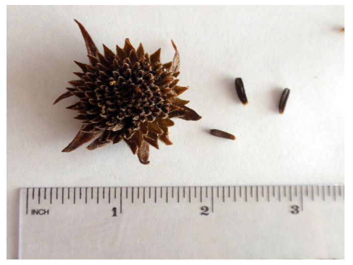
Figure 5. Arrowleaf balsamroot seed head and seeds.

Seed ripening depends on elevation and moisture and occurs later on more moist and/or higher elevation sites (USDA FS 1937). In western Montana, seed maturation at a 3,609-foot (1,100 m) site was 3 weeks earlier than at a 5,988-foot (1,825 m) site (Amsberry and Maron 2006). In a drought year when winter precipitation was 1.5 inches (3.8 cm) below average, plants began growing on March 25, about 1 month before usual, in sagebrush-bunchgrass communities at USSES. Plants were dry by May 1 and produced little seed (Pechanec et al. 1937).