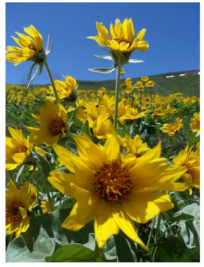
Figure 4. Arrowleaf balsamroot flowering is nearly uniform.

Flower heads are terminal on the stems and generally solitary, but can number as many as three (Fig. 4). They are 2.5 to 4 inches (6.3-10 cm) wide and are comprised of outer, yellow, female ray flowers and inner, yellow, perfect disk flowers (USDA FS 1937; Hitchcock and Cronquist 1973; Welsh et al. 1987; Taylor 1992; Weber 2006; LBJWC 2017). The number of ray flowers ranges from 8 to 25 but is most commonly between 13 and 21 (Stubbendieck et al. 1986; Cronquist et al. 1994). Both ray and disk flowers are fertile and produce seed, although the greatest percentage of seed is produced by disk flowers (Monsen, USFS [retired], personal communication, March 2018). Fruits are smooth, 3- to 4-angled cypselas up to 0.75 inch (2 cm) long and 2 mm wide (Wasser 1982; Belcher 1985; Welsh et al. 1987; Hickman 1993). Cypselas are brown to black when mature and lack a pappus or bristles (USDA FS 1937; Belcher 1985). Arrowleaf balsamroot cypselas, although not truly achenes, are widely referred to as such. Throughout this review, seed refers to the fruit or cypsela and the seed it contains. This is because the seed remains with the fruit during cleaning and it is the fruit that is planted.