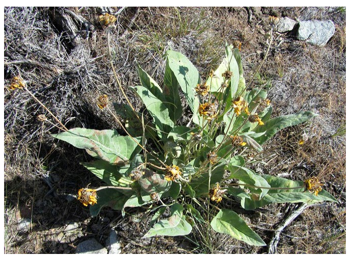
Figure 8. Appearance of arrowleaf balsamroot plants near wildland seed harvest time.

Wildland seed certification. Wildland seed collected for direct sale or for establishment of agricultural seed production fields should be Source Identified through the certification process that verifies and tracks seed origin (Young et al. 2003; UCIA 2015). For seed that will be sold directly, collectors must apply for certification prior to making collections. Applications and site inspections are handled by the state where collections will be made. For seed that will be used for agricultural seed fields, nursery propagation, or research, the same procedure must be followed. Seed collected by some public and private agencies following established protocols may enter the certification process directly, if the protocol includes collection of all data required for Source Identified certification (see Agricultural Seed Field Certification section). Wildland seed collectors should become acquainted with state certification agency procedures, regulations, and deadlines in the states where they collect. Permits or permission from public or private land owners is required for all collections.