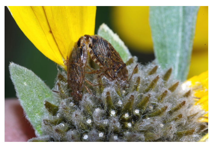
Figure 6. Lygaeid bug (Lygaeidae) feeding on arrowleaf balsamroot seeds.

Predation. Seed production is commonly limited by predation by insects and mammals (Fig. 6). In western Montana, lepidopteran larvae (Tortricidae) and tephritid (Tephritidae) and cecidomyiid (Cecidomyiidae) fly larvae fed on arrowleaf balsamroot flowers (Amsberry and Maron 2006). Lepidopteran larvae were the most abundant and damaging flower herbivores. Of 902 seed heads sampled, 68% were damaged by lepidopteran larvae. Plants also lost an average of 5.9 flower heads or 43% of total good seed heads produced to small mammal and ungulate herbivores, often as seed was maturing (Amsberry and Maron 2006). Deer mice (Peromyscus maniculatus) preved heavily on arrowleaf balsamroot seed in grasslands of western Montana. In the summer and fall of a single year, deer mice removed all seed provided in experiments, and seedlings were almost entirely restricted to areas protected from deer mice (Pearson and Callaway 2008). For more on plant and seed predation, see Grazing Response and Wildlife and Livestock Use sections.