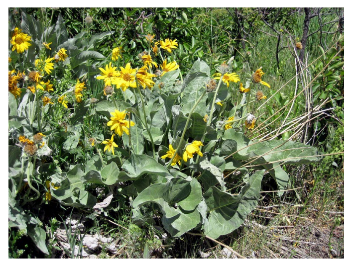
Figure 3. Arrowleaf balsamroot growing in Wyoming.

Above Ground. Plants are strongly tufted, densely leafy from the base, and large (up to 2.5 feet [75 cm] tall when flowering) (Fig 3; Blaisdell 1958; Welsh et al. 1987). Weaver (1915) counted up to 39 individual shoots arising from a single crown measuring 9 inches (23 cm) in diameter. Stems are almost leafless and end in large, yellow, typically solitary, sun-flower like inflorescences (Weber 2006; Pavek et al. 2012; LBJWC 2017). Stems and basal leaves are covered in dense soft hairs giving them a gray-green color (Hitchcock and Cronguist 1973; Weber 2006). Young leaves are silver with fine, felt-like hairs, especially on the undersides, but leaves become less hairy and greener with age (Hitchcock and Cronquist 1973). Basal leaves are arrowhead to heart-shaped and up to 18 inches (46 cm) long and 6 inches (15 cm) wide with long petioles. Stem leaves, if present, are few and reduced, almost bract-like (Welsh et al. 1987; Taylor 1992; Cronquist et al. 1994).