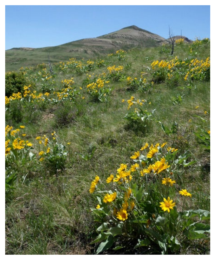
Figure 1. Arrowleaf balsamroot growing in Wyoming grassland.

balsamroot vegetation type is common on warm, moist sites, and the bluebunch wheatgrass-Sandberg bluegrass ( Poa secunda )-arrowleaf balsamroot vegetation type is common on hot, dry sites (Powell et al. 2007).