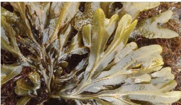
ROCKWEED, Fucus gardneri