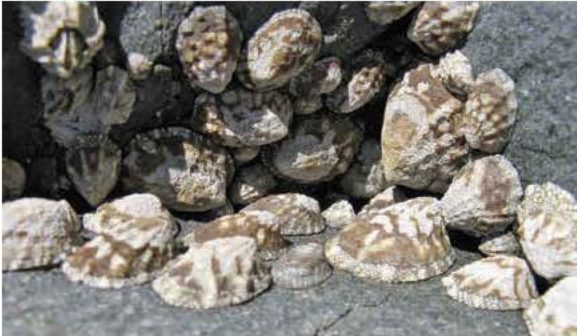
LIMPET, Lottia spp.