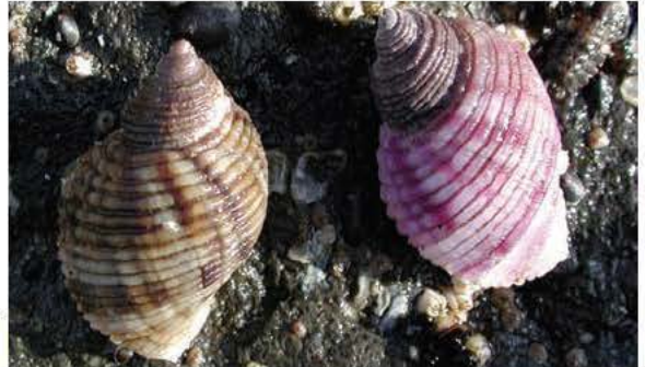
WHELK, Nucella spp.