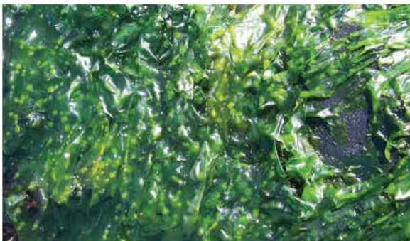
SEA LETTUCE, Ulva lactuca