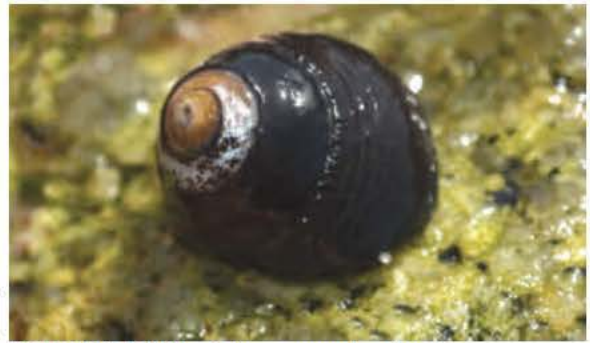
TURBAN SNAIL, Chlorostoma funebris