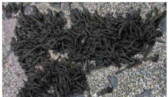
BLACK PINE, Neorhodomela larix