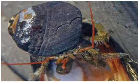
HERMIT CRAB, Pagurus spp.