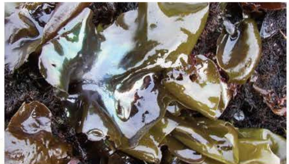
IRIDESCENT ALGAE, Mazzaella splendens