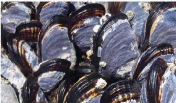
CALIFORNIA MUSSEL, Mytilus californianus