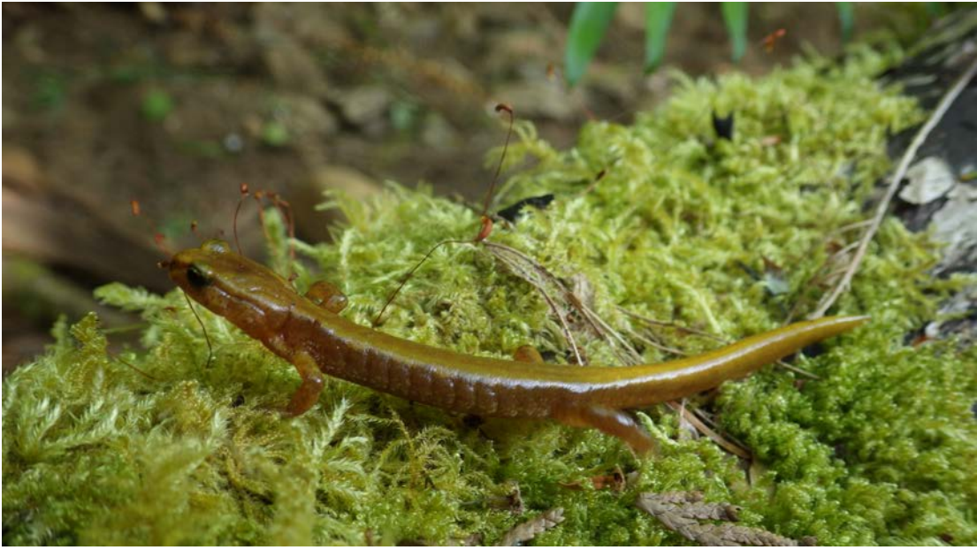
Yellow phase Plethodon vandykei .