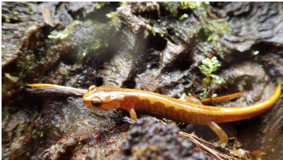
Yellow phase Plethodon vandykei .

Van Dyke's Salamander can be variable in both ground and stripe color (e.g., Leonard et al. 1993; Jones et al. 2005). Different color phases are described based on ground color, which can be black, yellow, or pink (Brodie and Storm 1970; Nussbaum et al. 1983). The dark phase has a black ground color and yellow or red stripe; the yellow phase is tan or yellow with an indistinct stripe; and similarly, the rose phase is pinkish with an indistinct stripe (Nussbaum et al. 1983). Leonard et al. (1993) and Jones and Crisafulli (2005) combine the yellow and rose phases into a "light phase." Dark phase individuals have white speckling on the sides and a yellow throat (Leonard et al. 1993). Nussbaum et al. (1983) report that the rose phase is common in the Willapa Hills, the yellow phase occurs in the Willapa Hills and the Olympic Peninsula, whereas most individuals in the Cascade Range are dark phase. Hatchlings are always dark phase. Jones and Crisafulli (2005) describe the dorsal stripe as having “drips of color extending from the dorsal stripe onto the sides, which is most conspicuous on juveniles or dark phase adults.”