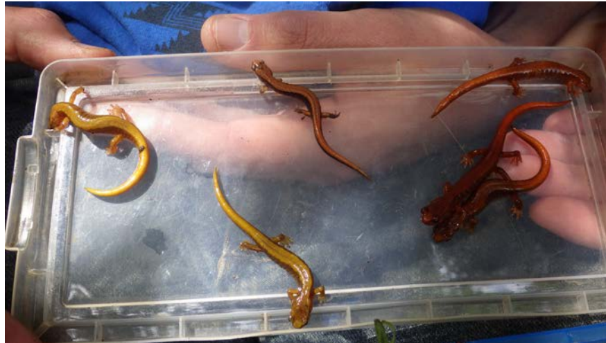
Yellow phase (left) and dark phase (right) with a rose-colored stripe.

Van Dyke's is a relatively stocky plethodontid salamander with a short body (Cascade Range animal: maximum snout-vent length, SVL = 64 mm; maximum total length 122 mm; Aimee McIntyre, pers. comm.) and only 0.5-3.0 intercostal folds between adpressed limbs (Nussbaum et al. 1983). It has the smallest number of costal grooves (mode = 14), widest head relative to its size, and shortest tail of all western Plethodon (Nussbaum et al. 1983). It has parotoid glands and slightly webbed toes (Jones and Crisafulli 2005).