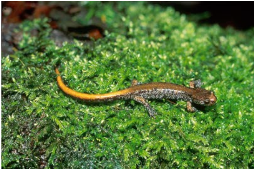
Dark phase Plethodon vandykei with a black ground color and yellow stripe.