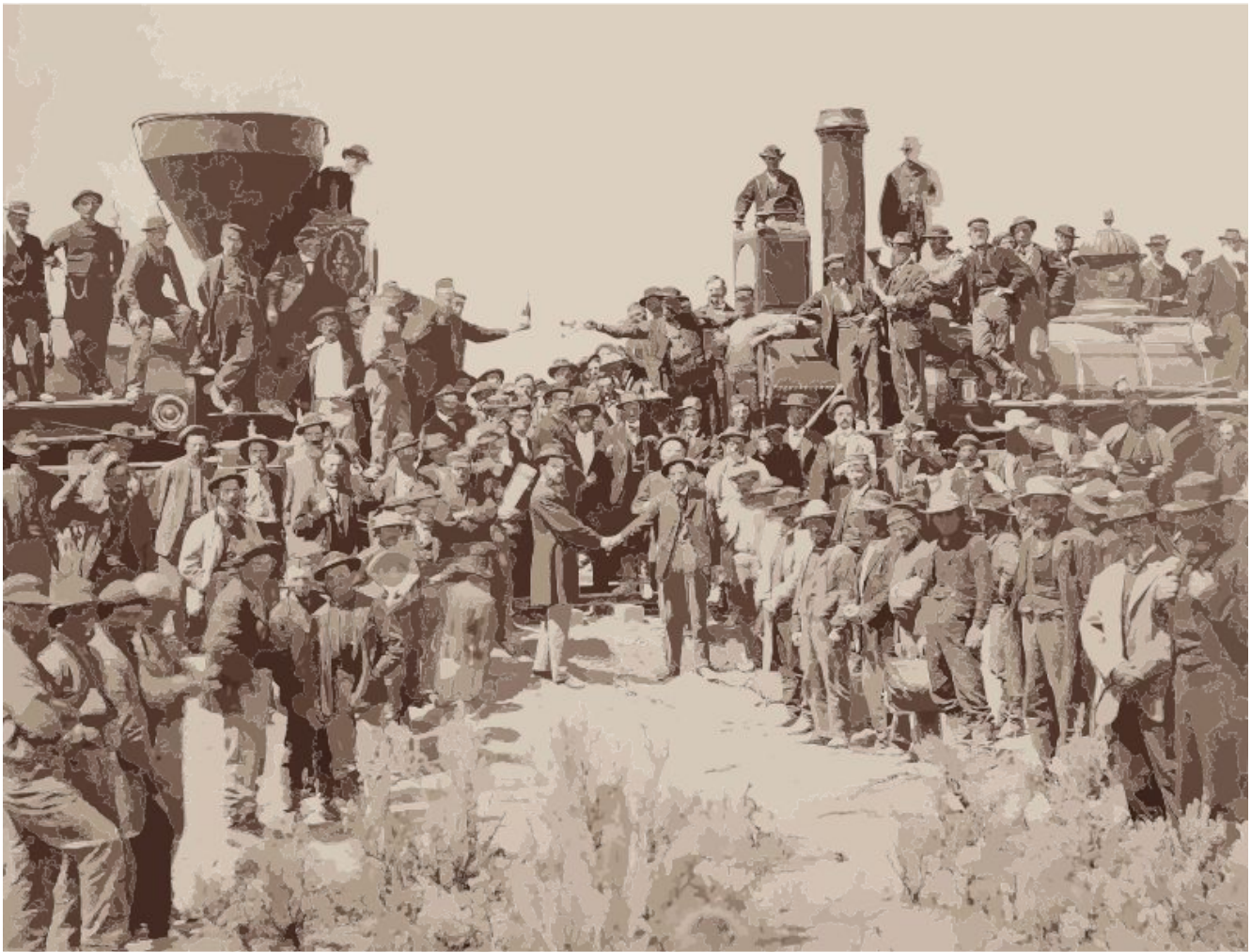
The Champagne Photo - Andrew J. Russell