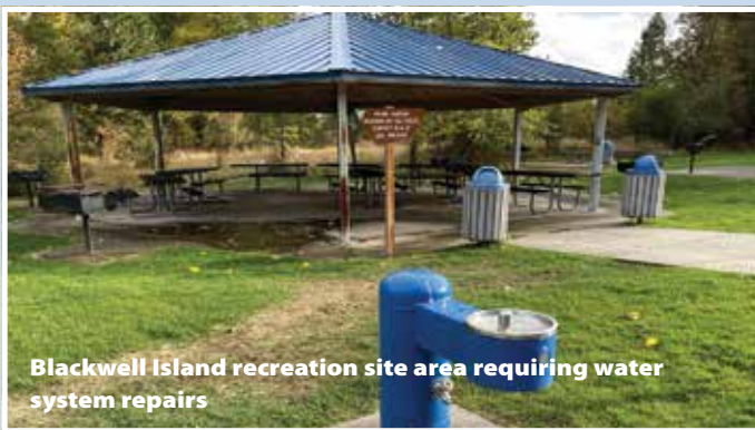
Blackwell Island recreation site area requiring water system repairs