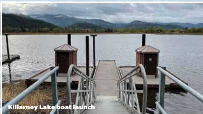
Killarney Lake boat launch