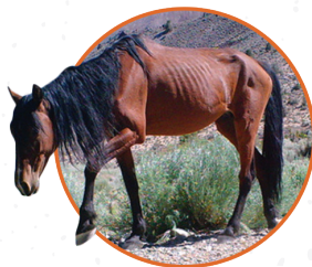
Starvation and thirst for horses, burros and other wildlife

Overpopulated herds threaten land and herd health. Too many wild horses and burros can lead to: