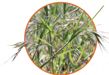
Less native vegetation and more invasive weeds, such as cheatgrass