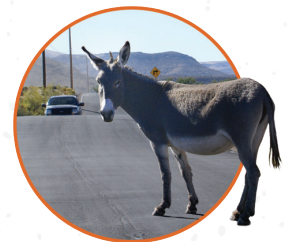
More wild horses and burros on highways and private property in search of food and water