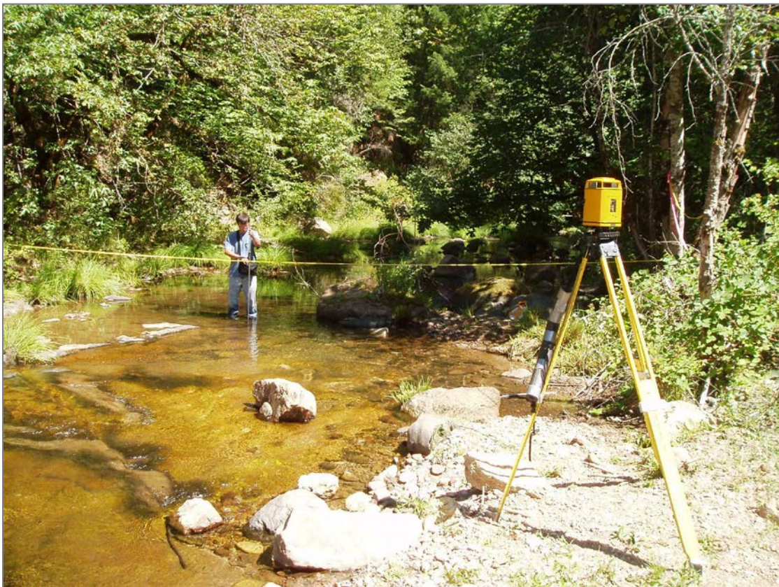
Cross-Section at Sugarpine Creek, Medford District.