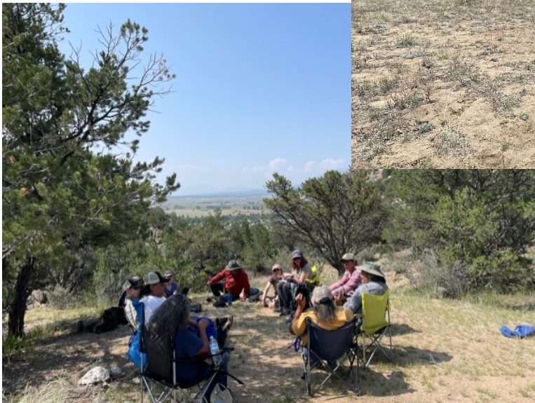
Figure 2. Tribal Elders and representatives, BLM interns and Living Heritage Research Council staff during site visit to Ruby Mountain