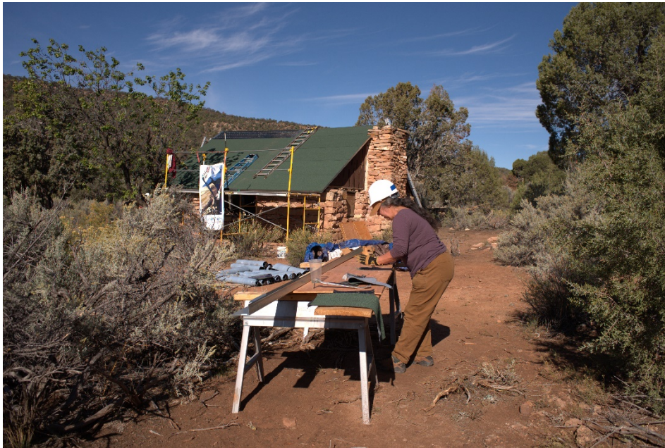
Figure 3. HistoriCorps volunteers works on preparing roofing materials

Calamity Camp is a well-known site within the local population, some of whom have relatives who worked and lived at the site. The site's association with World War II-era uranium exploration and extraction make it an important part of U.S. history. The BLM Grand Junction Field Office continued stabilization work on Calamity Camp, a site listed on the National Register of Historic Places. Partnering with HistoriCorps, a non-profit organization with expertise in historic preservation, the BLM was able to stabilize the two main residences at Calamity Camp, as well as assess an additional building for future stabilization and restoration. Additionally, the BLM partnered with the Western Colorado Conservation Corps (WCCC) to repair an existing fence put into place to keep off-road vehicles from traveling off-route throughout the site. WCCC was also able to help HistoriCorp in stabilization work.