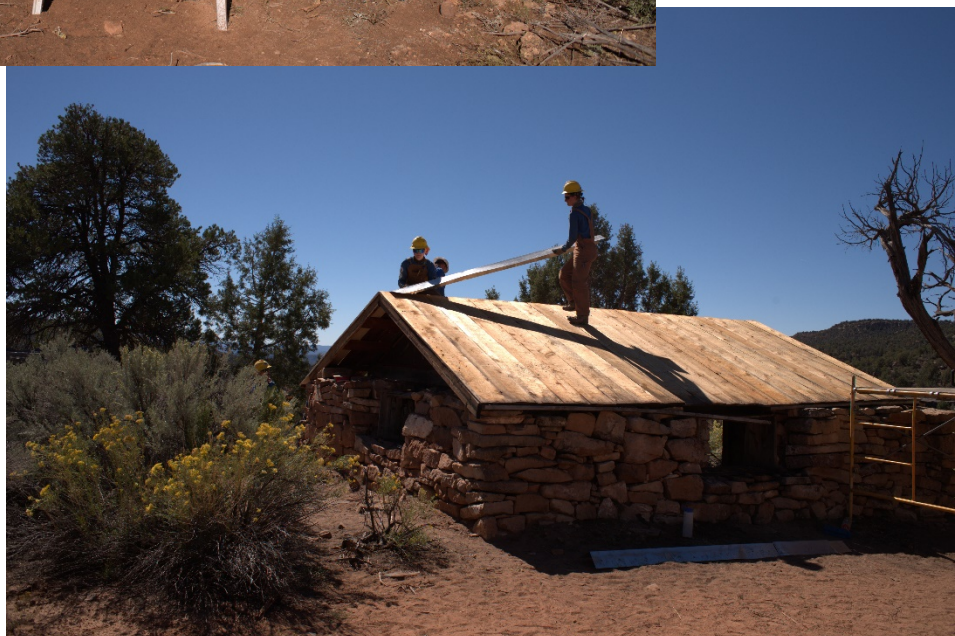
Figure 4. Western Colorado Conservation Corps members assist HistoriCorps in replacing a roof at Calamity Camp