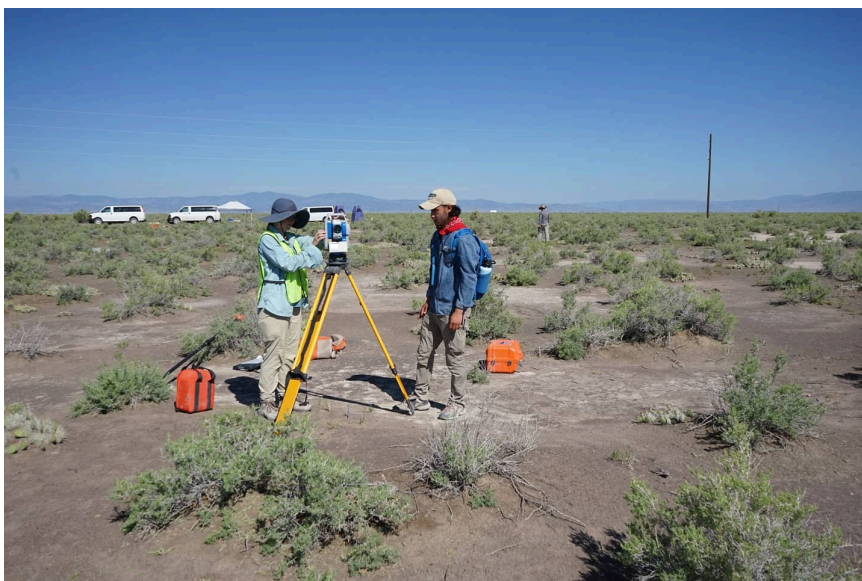
Figure 7. Students mapping artifacts

Beyond the field school, two high school level groups from the Great Sand Dunes National Park Service Youth Archaeology Camp visited and conducted survey at the site. This group is comprised of local students from the San Luis Valley who are interested in our shared history and potential careers in resource management.