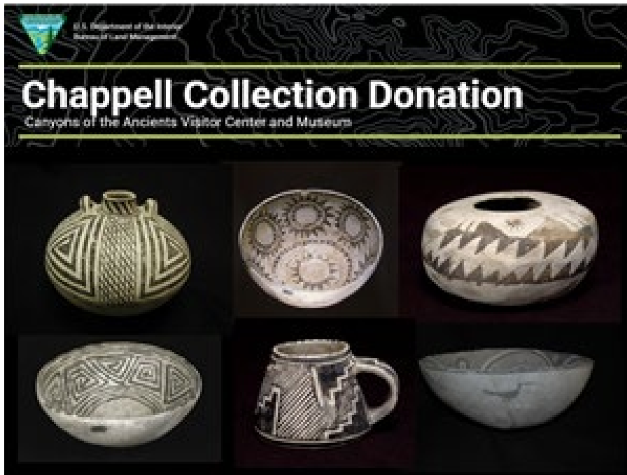
Figure 10. Examples from the Chappell Collection

In May 2021, the Canyons of the Ancients Visitors Center and Museum accessioned the “Chappell Collection” through the BLM 1105 Donation policy. The Chappell Collection includes 4,921 artifacts and 1,056 archives purchased the Anasazi Historical Society from Cliff and Ruth Chappell in 1982 and on “permanent” loan to the Bureau of Land Management Canyons of the Ancients Visitor Center and Museum (formerly known as the Anasazi Heritage Center) since 1988. The Chappell Collection is comprised of archeological objects collected from private lands in southwest Colorado and adjacent states, as well as the Chappell’s field notes. Artifacts represent a wide variety of Ancestral Puebloan material culture from the Northern San Juan region, including ceramics, chipped stone, bone, textiles, ornaments, groundstone, shell, and organic material. The BLM fully cataloged the Collection, housing the materials in a facility ensuring secure and stable conditions, and providing for public access and use, in accordance with DOI collections standards (411 DM Museum Property Handbook).