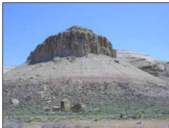
Johnston Scout Rock Kemmerer, Wyoming