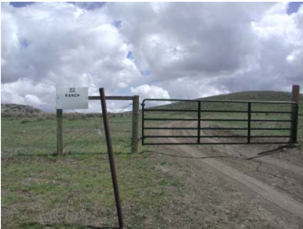
The existing road entering public land on the opposite side of the gate in section 1 will not require additional work.