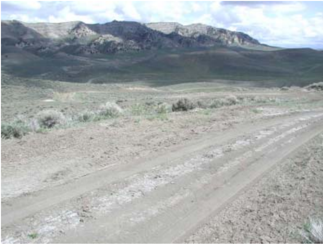
The existing road on public land in section 2 will not require additional work.