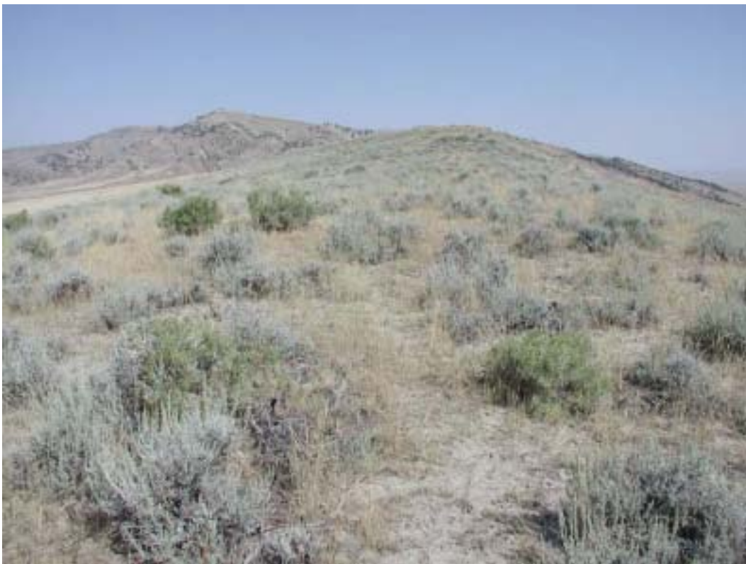
The proposed WWDC well site is viewed north toward Black Mountain.