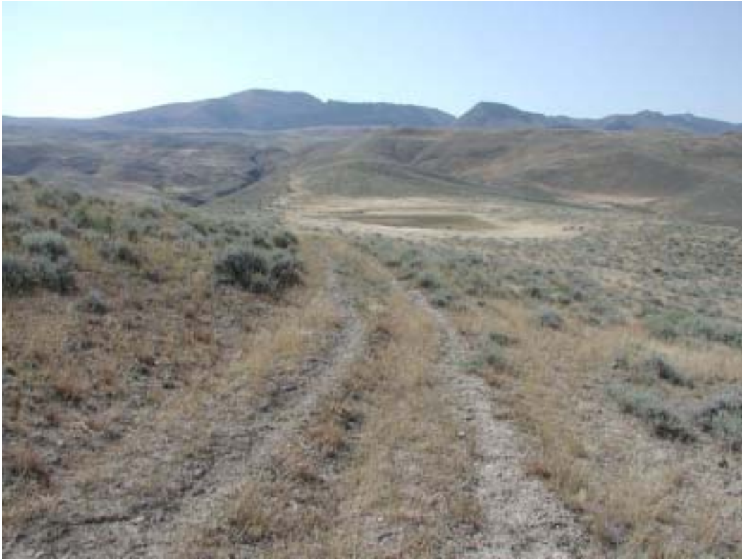
The WWDC water well site is proposed to be located left of the water catch basin shown in the upper photo. The view is south toward Lysite Mountain.