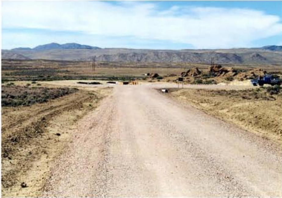
TYPICAL RESOURCE ROAD WITH 14-FOOT GRAVELED SURFACE TO BE USED TO ACCESS WELL PAD SITE (PRIOR TO RECLAMATION).