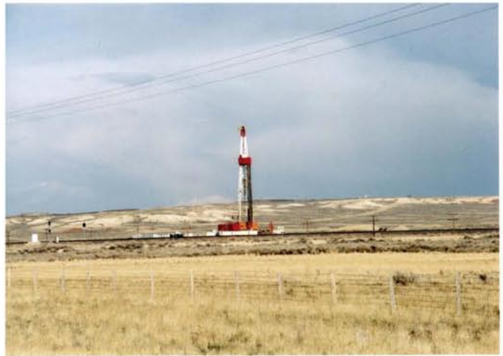
TYPICAL "DEEP-HOLE" DRILL RIG TO BE USED FOR DRILLING INTO THE MESAVERDE FORMATION. DEPTHS WILL VARY FROM A FEW THOUSAND FEET TO OVER 10,000 FEET. TRUCK-MOUNTED RIGS MAY BE USED FOR THE SHALLOWER MEDICINE BOX/FOX HILL COALS.