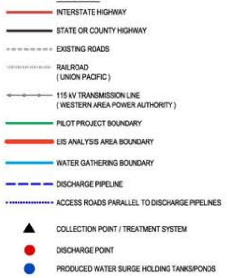
Seminoe Road Gas Development Project EIS FIGURE 14 DIRECT DISCHARGE INTO SEMINOE RESERVOIR - ALTERNATIVE C