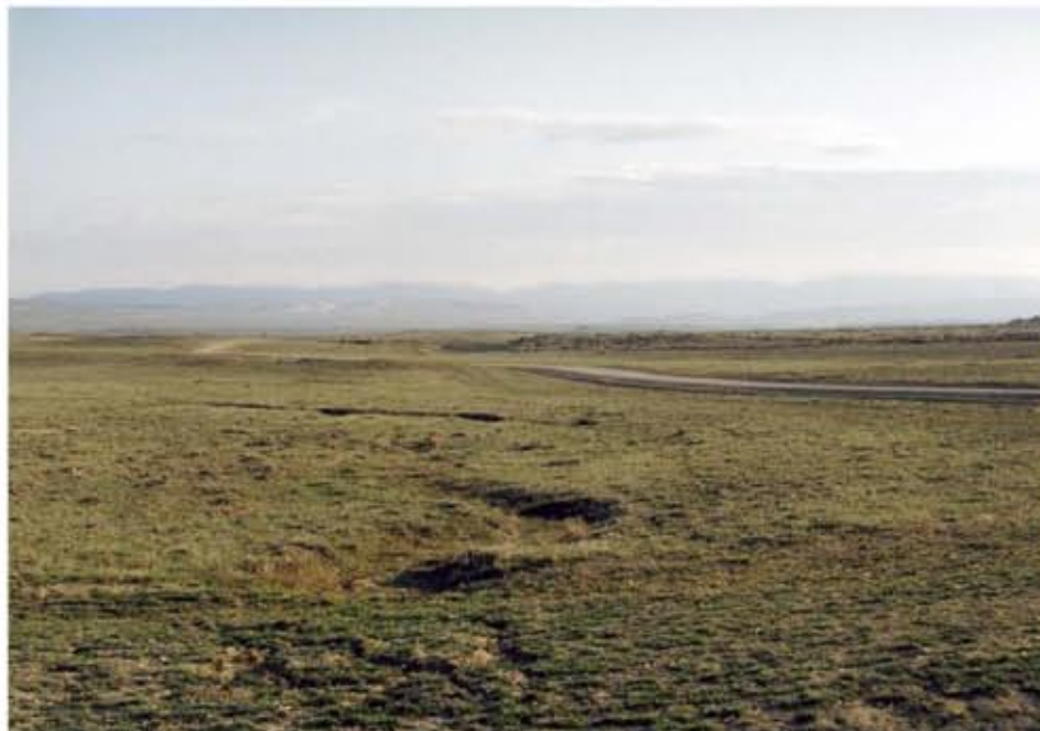
EXISTING 14-FOOT GRAVELED SURFACE RESOURCE ROAD AT PILOT PROJECT. BORROW DITCHES ON EITHER SIDE OF ROADWAY; NOTE REVEGETATION ON BOTH SIDES OF ROAD.

NOTE: UPGRADED OR NEWLY CONSTRUCTED ROADS WOULD MEET STANDARDS OUTLINED IN BLM 9113 MANUAL. ROADS WOULD BE DESIGNED FOR ALL-WEATHER TRAVEL, WITH TURNOUTS AS NECESSARY.