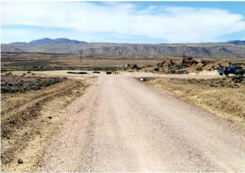
EXISTING ROAD AT PILOT PROJECT. THIS ROAD ACCESSES WATER TREATMENT FILTRATION TANKS. THERE IS 14-FOOT GRAVELED SURFACE.