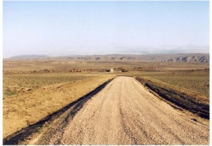
EXISTING 14-FOOT GRAVELED SURFACE ROAD AT PILOT PROJECT. NOTE PILOT PROJECT AERATION TANKS IN MIDDLE FOREGROUND. BORROW DITCHES VERY EVIDENT IN THIS PHOTO.